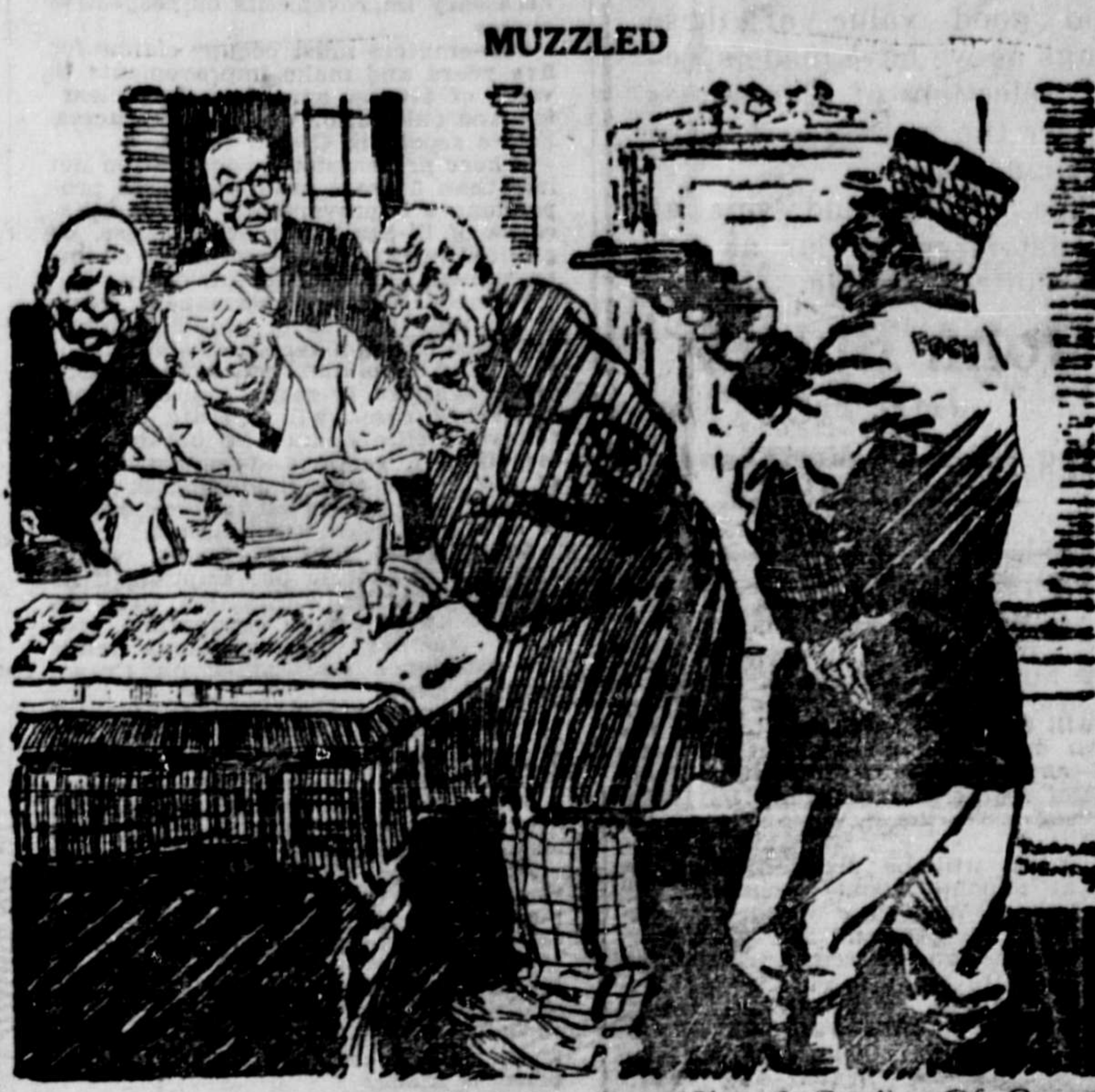
The Hun—B — But My Tear Sirs, I Can't—Of Course I Will Sign.