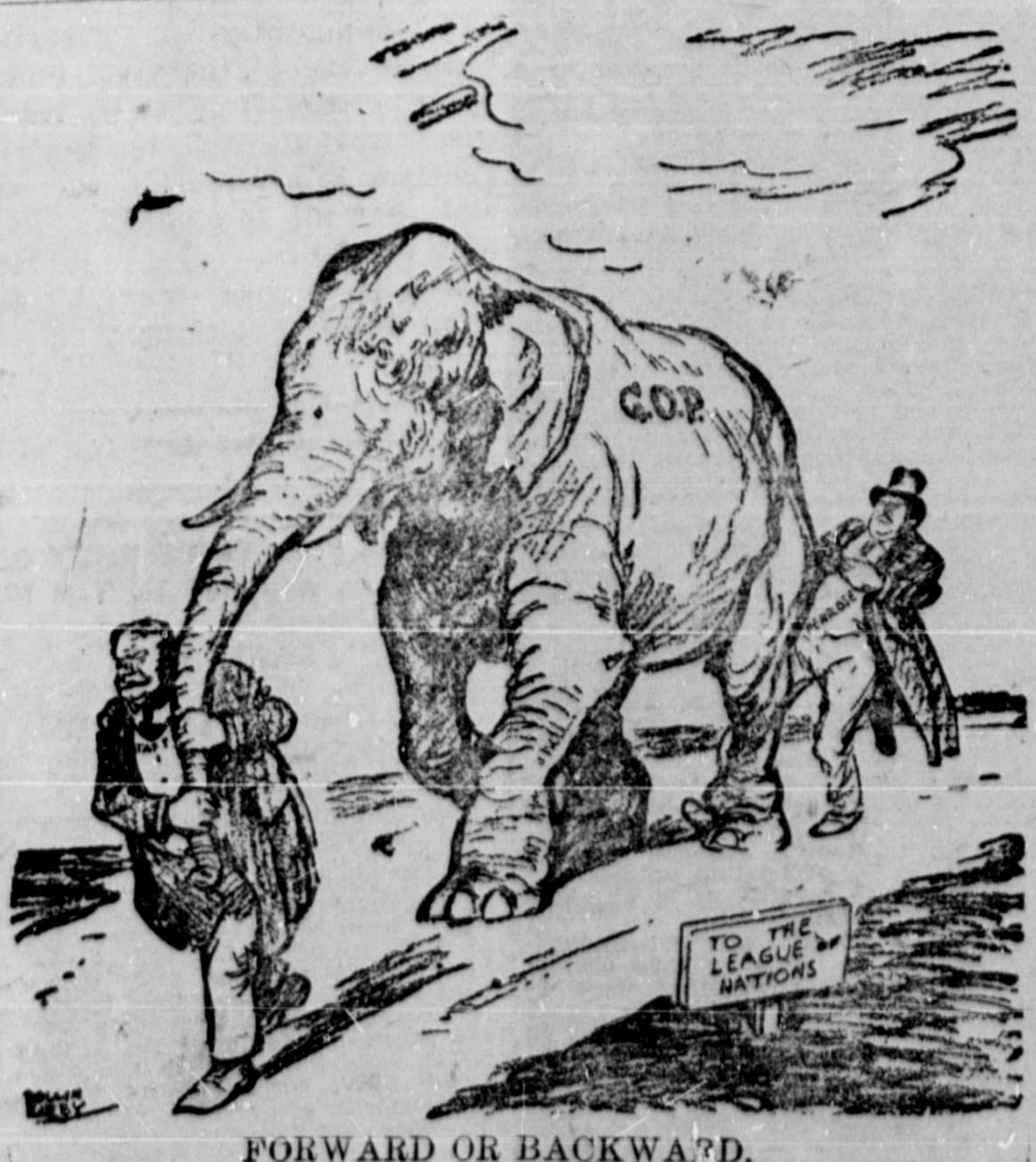
FORWARD OR BACKWARD.

New Show Tonight Empress Theatre METRO presents HAROLD LOCKWOOD in "Broadway Bill" A thrilling story of New York and the lumber camps JEWEL presents "The Geezer of Berlin" A Tragedy in "The Kaiser, the Beast of Berlin," 2 parts. And KING BAGGOT in "A WHIRLWIND OF LAUGHTER" Admission 15 and 30 cents Two Shows, 7.15 and 9. Wed., 9th Episode, "Woman in the Web"