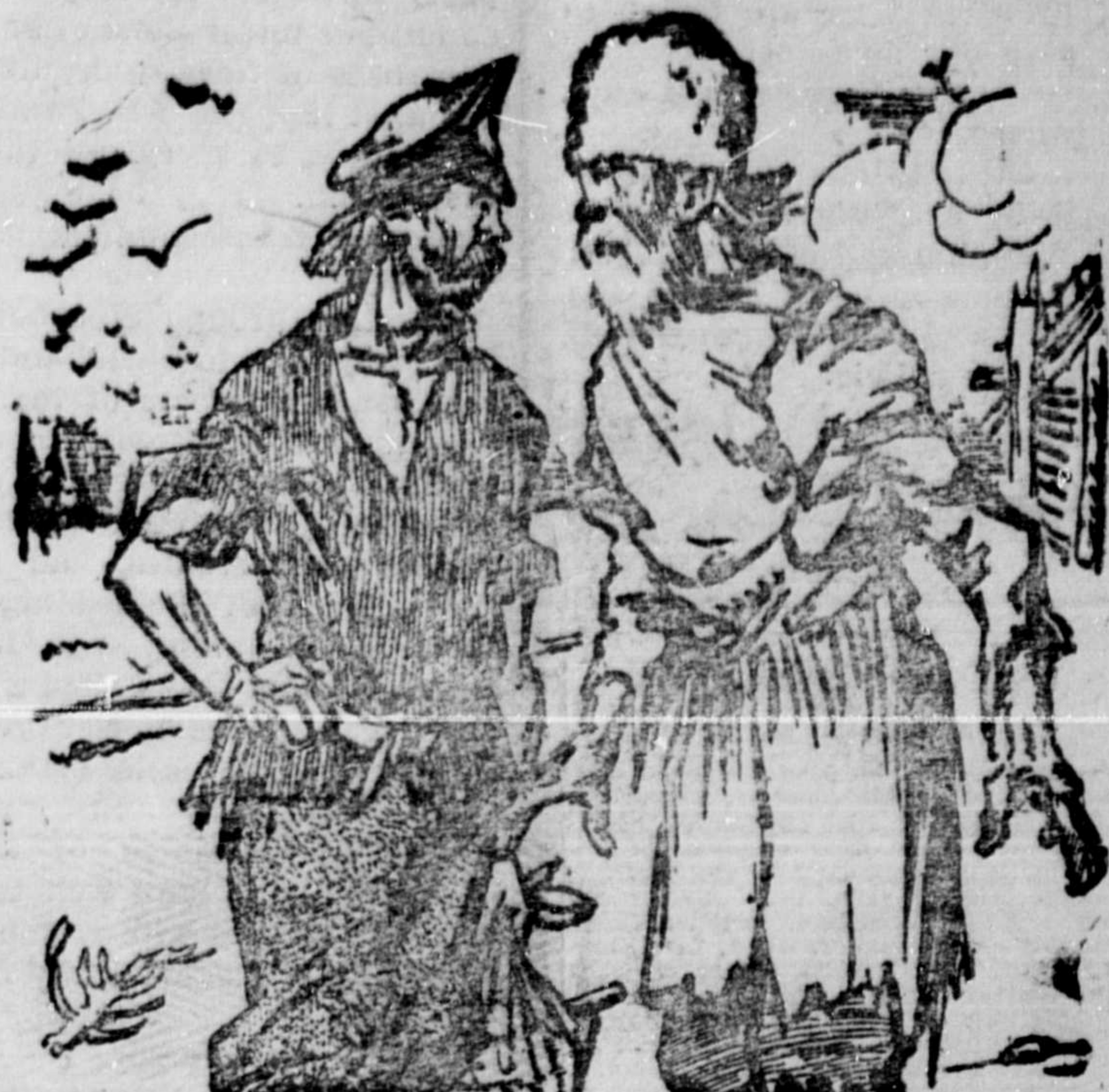
Hung by the Czar or shot by the Soviets I don't see much difference. There is though under the Czar we hata.

SELF'S FOR QUALITY SERVICE AND SATISFACTION Food Board Licence No. 10-7340.