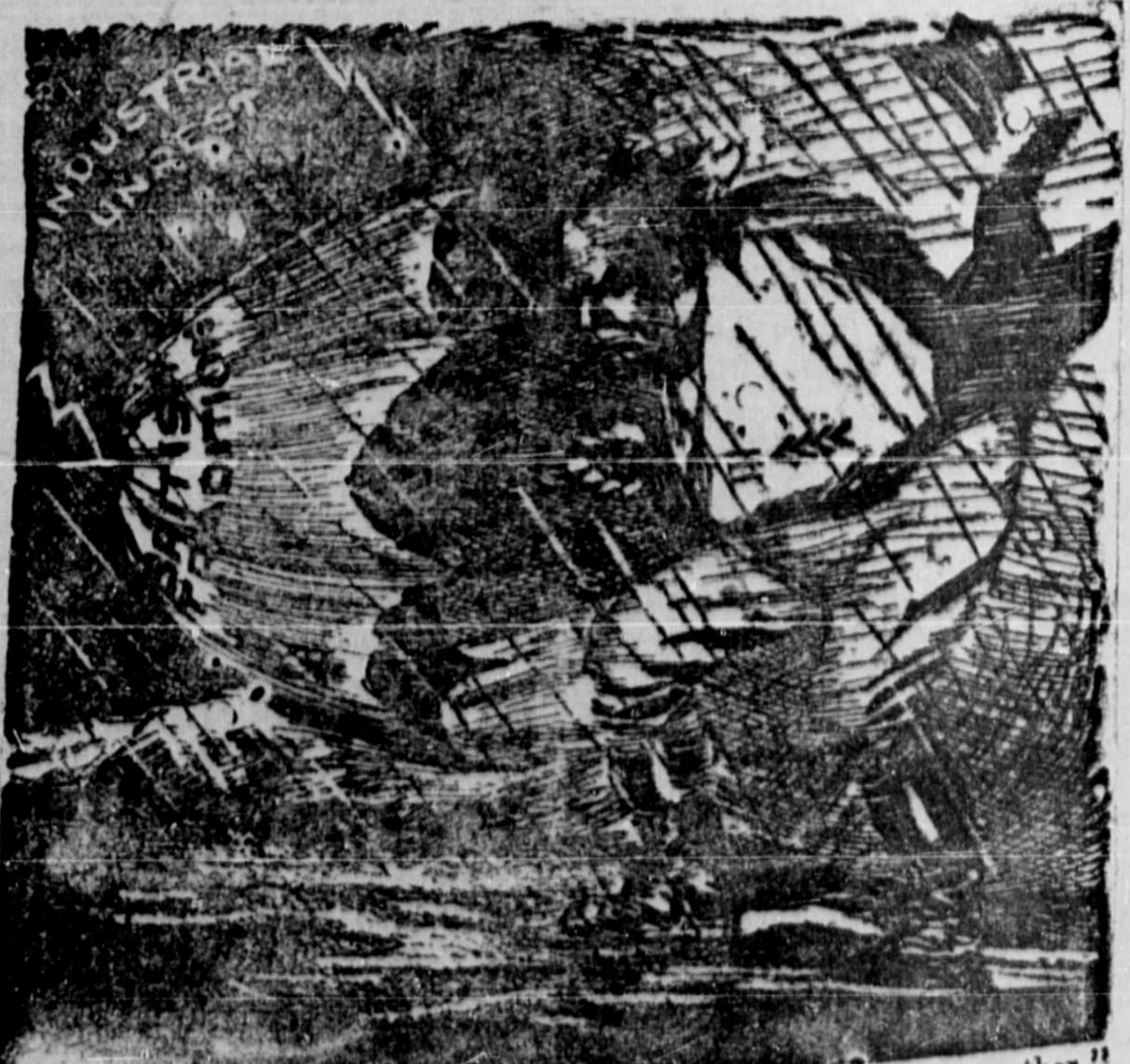
THE INVALID (J. B.); "Just as I needed some nice weather."

Grazing Act, 1919, for systematic development of livestock industry pro- vides for grazing districts and range administration under Commissioner. Annual grazing permits issued based on numbers ranged; priority for estab- lished owners. Stock-owners may form Associations for range manage- ment. Free, or partially free, permits for settlers, campers or travellers, up to ten head.