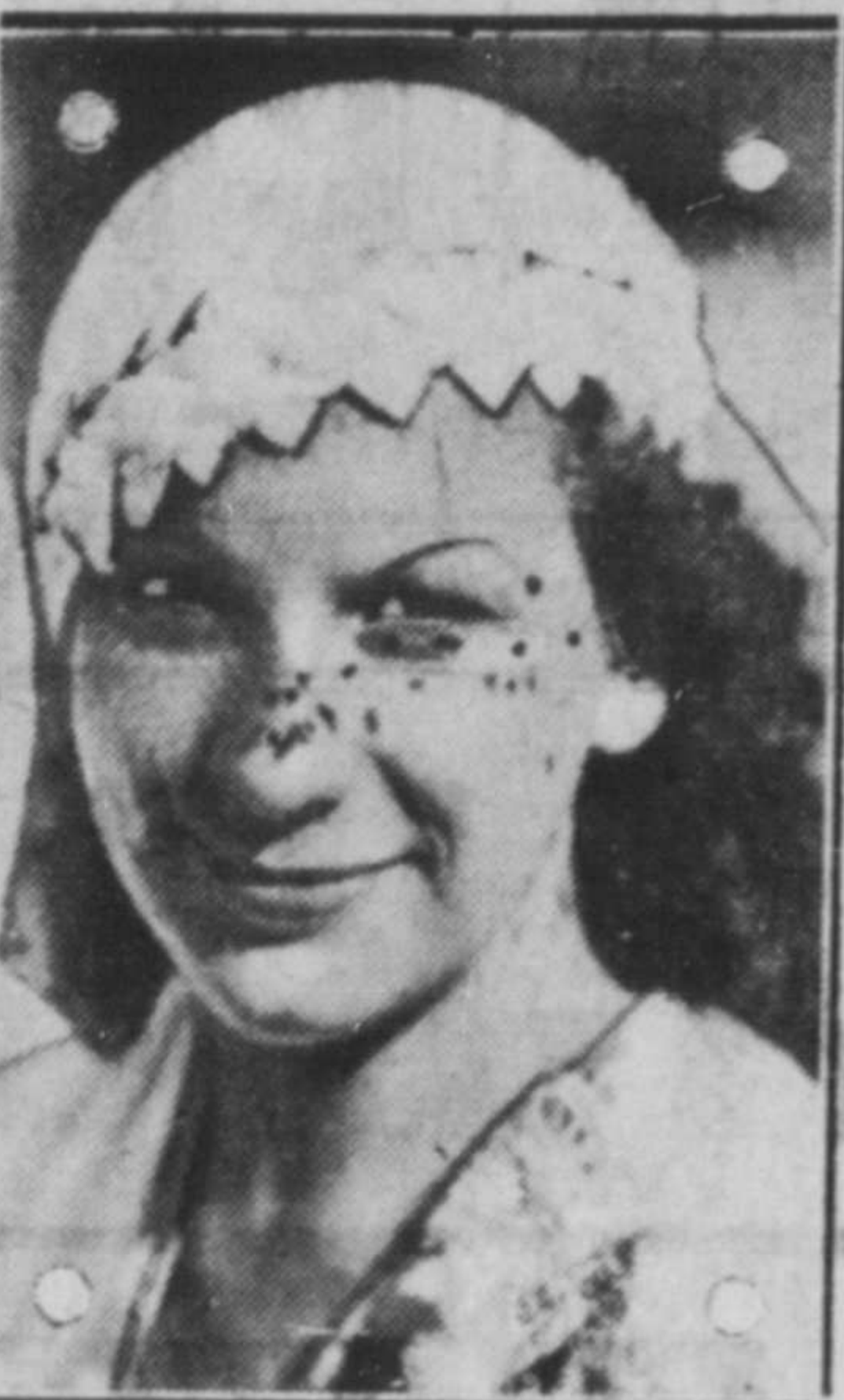
Pictures of girl swimmers are usually all wet and wavy—but pipe this new line. Helene Madison Olympic girl swim champion, in landlubber's garb.