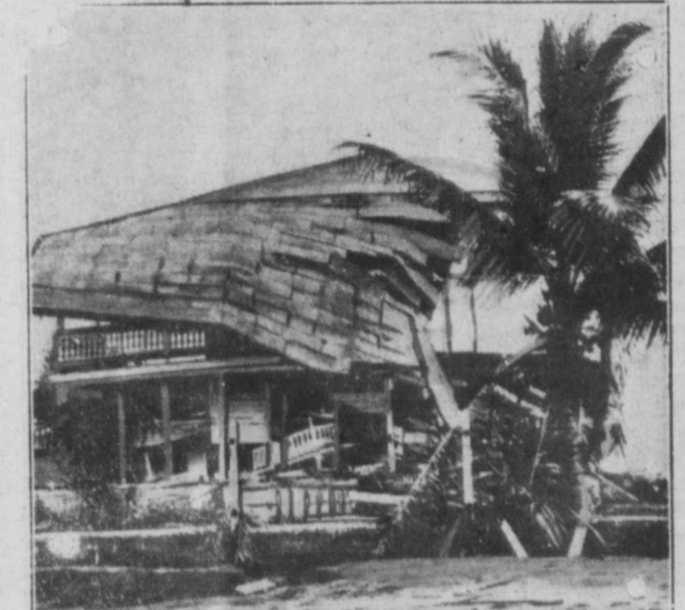
One of the scores of dwellings in Cuyutlan, Mexico, where many were recently killed and injured when 'quake and tidal wave wrecked every building in the town. Most of victims were children at play on the beach.