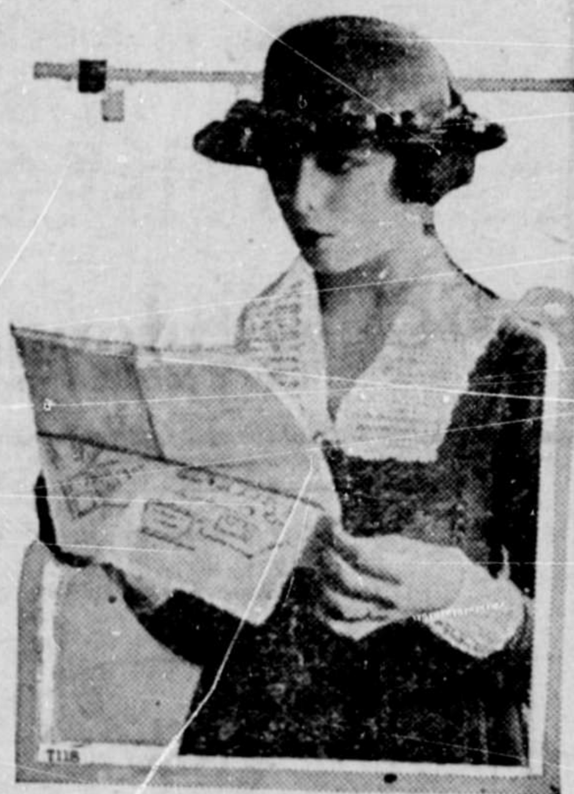
SHIRLEY MASON in "Come on in" A Paramount Picture