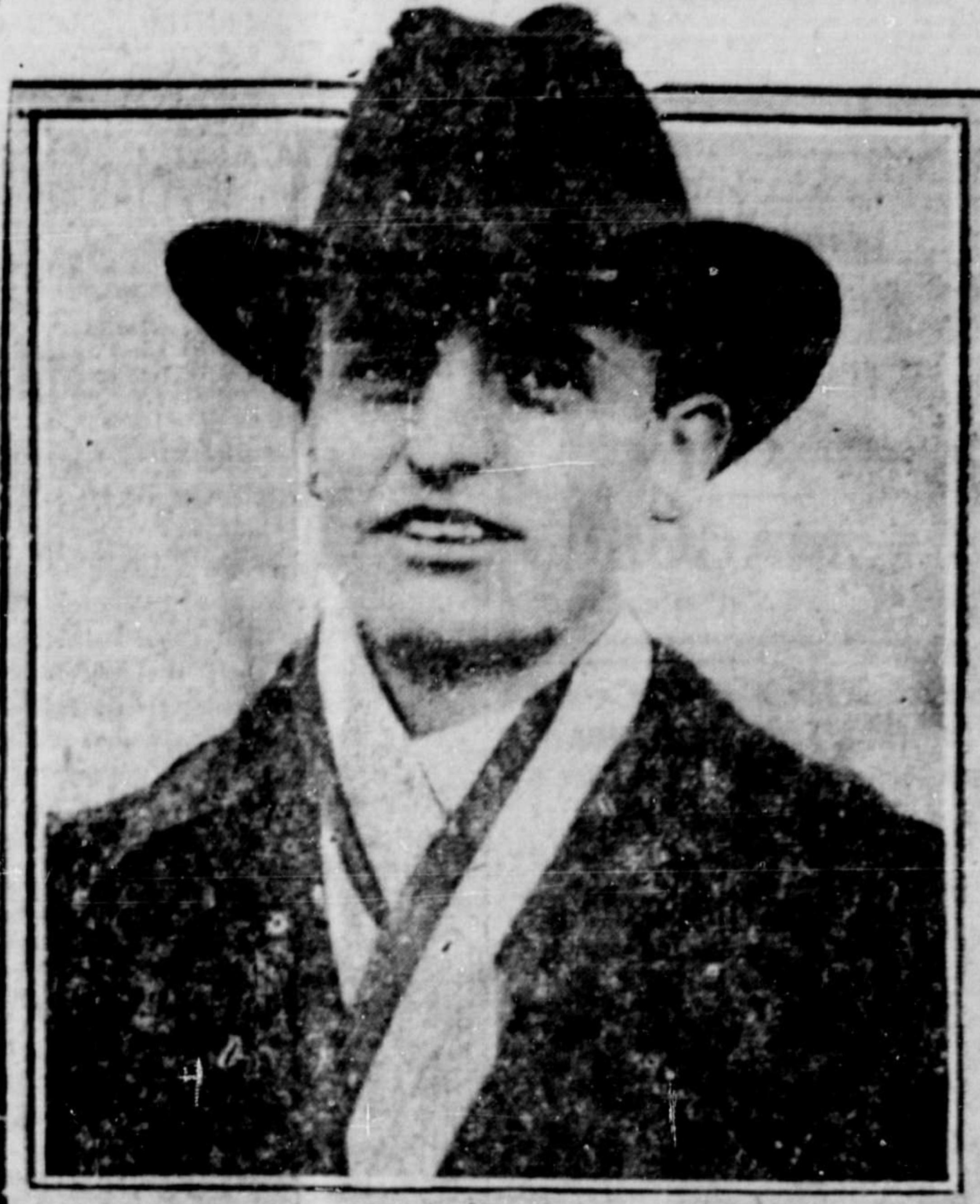
Captain Archibald B. Roosevelt, son of the late Theodore Roosevelt, returned home on a leave of absence from his command of the 1st Battalion of the 1st Canadian Trench Battalion, after a tour of duty in France a few days ago and looked the picture of health. The picture was taken upon his arrival.