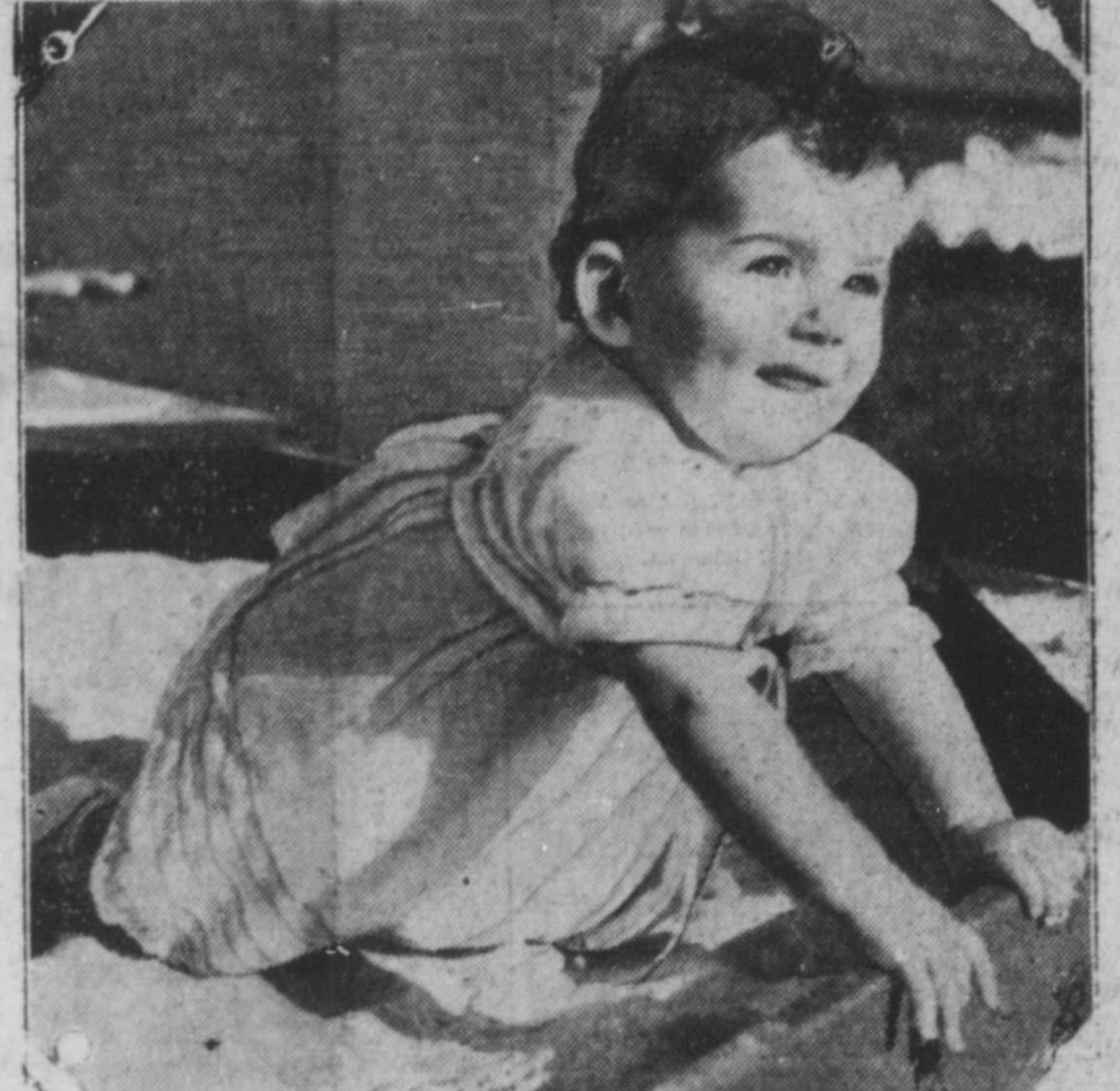
She's camera conscious already. If you don't believe it take a closer look at the smile being flushed at the photographer by ten-months-old daughter of Ben Lyon and Bebe Daniels.