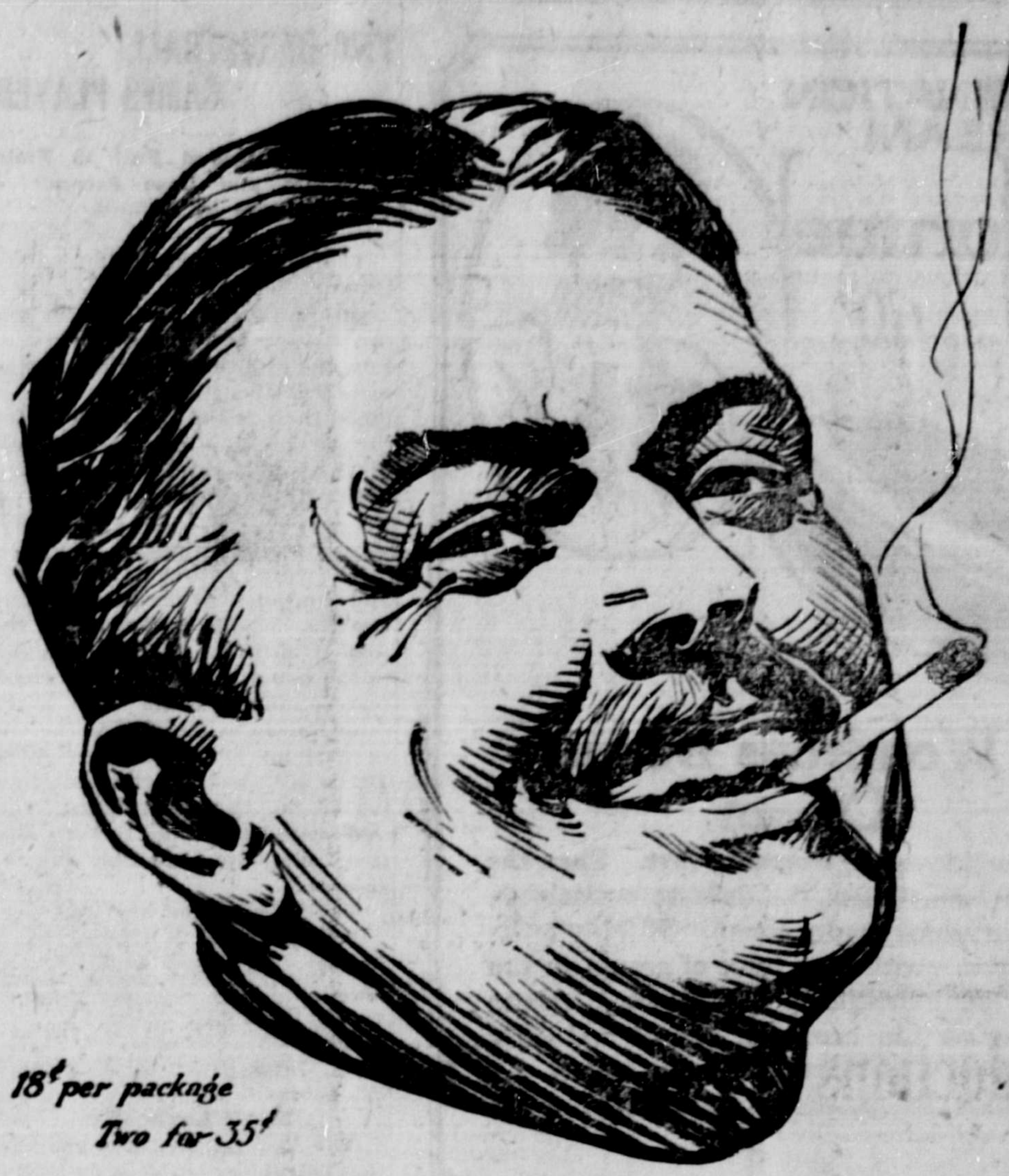
18¢ per package Two for 35¢

Miss Hart's last appearance before leaving England was at the Crystal Palace, where she has always been a great favorite.