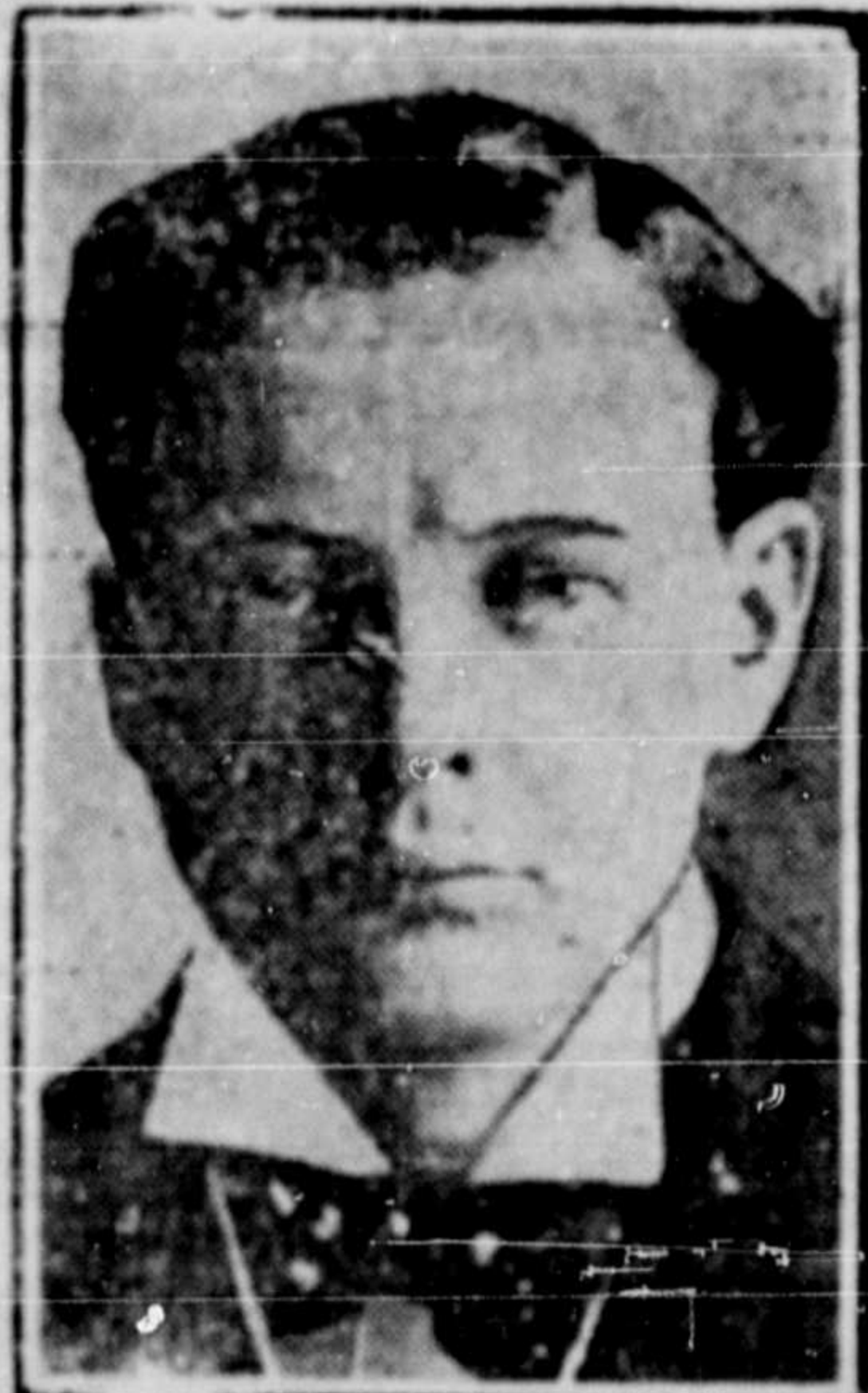
Right Hon. Winston Churchill who, it is semi-officially announced will accept position of Secretary for the Colonies.