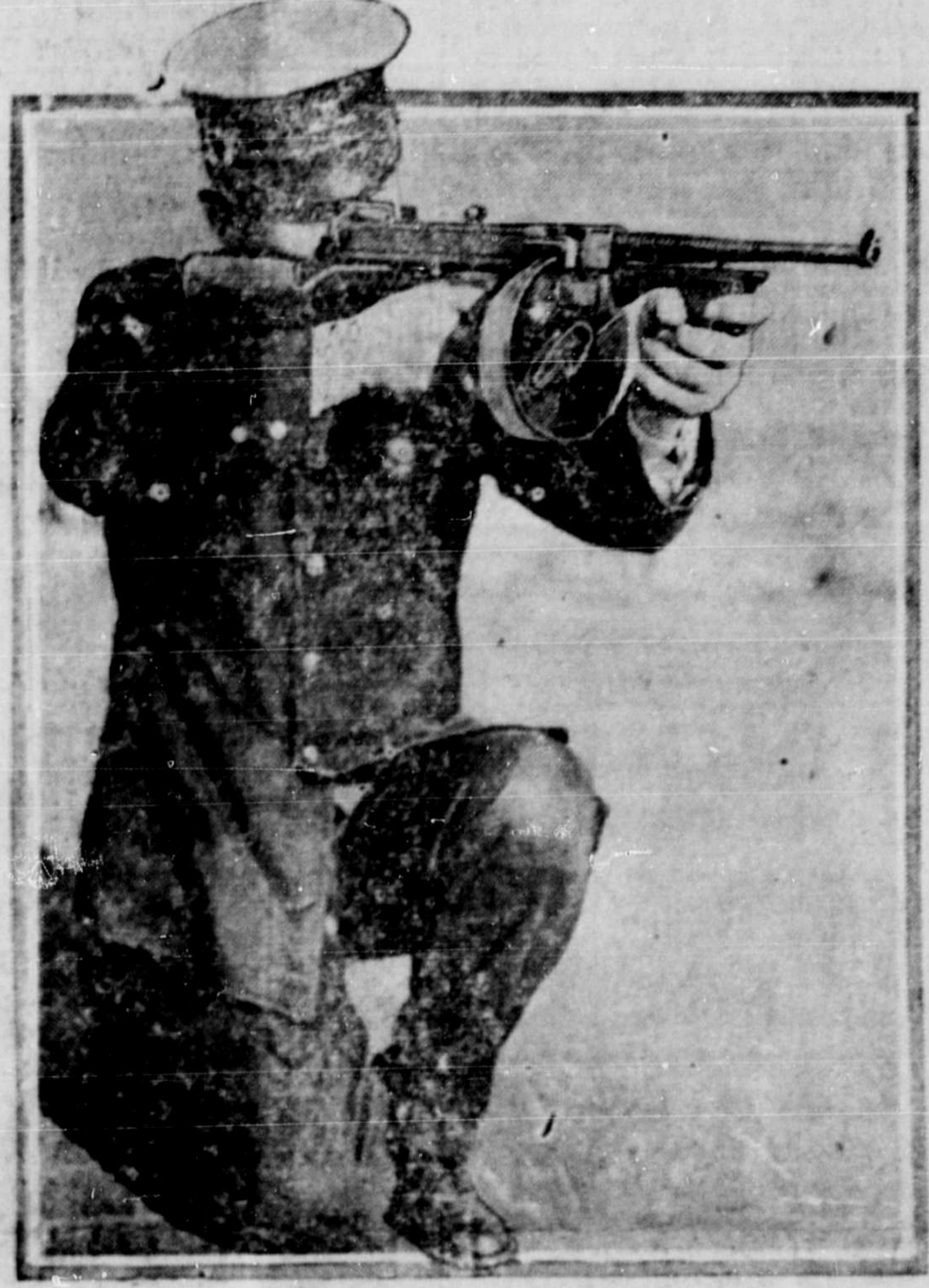
This deadly weapon, especially designed for automobile bandits, is twenty two inches long, weighs seven pounds and holds fifty bullets. They have been made a part of the New York Police Department to wage war upon criminals who use automobiles to make their raids.