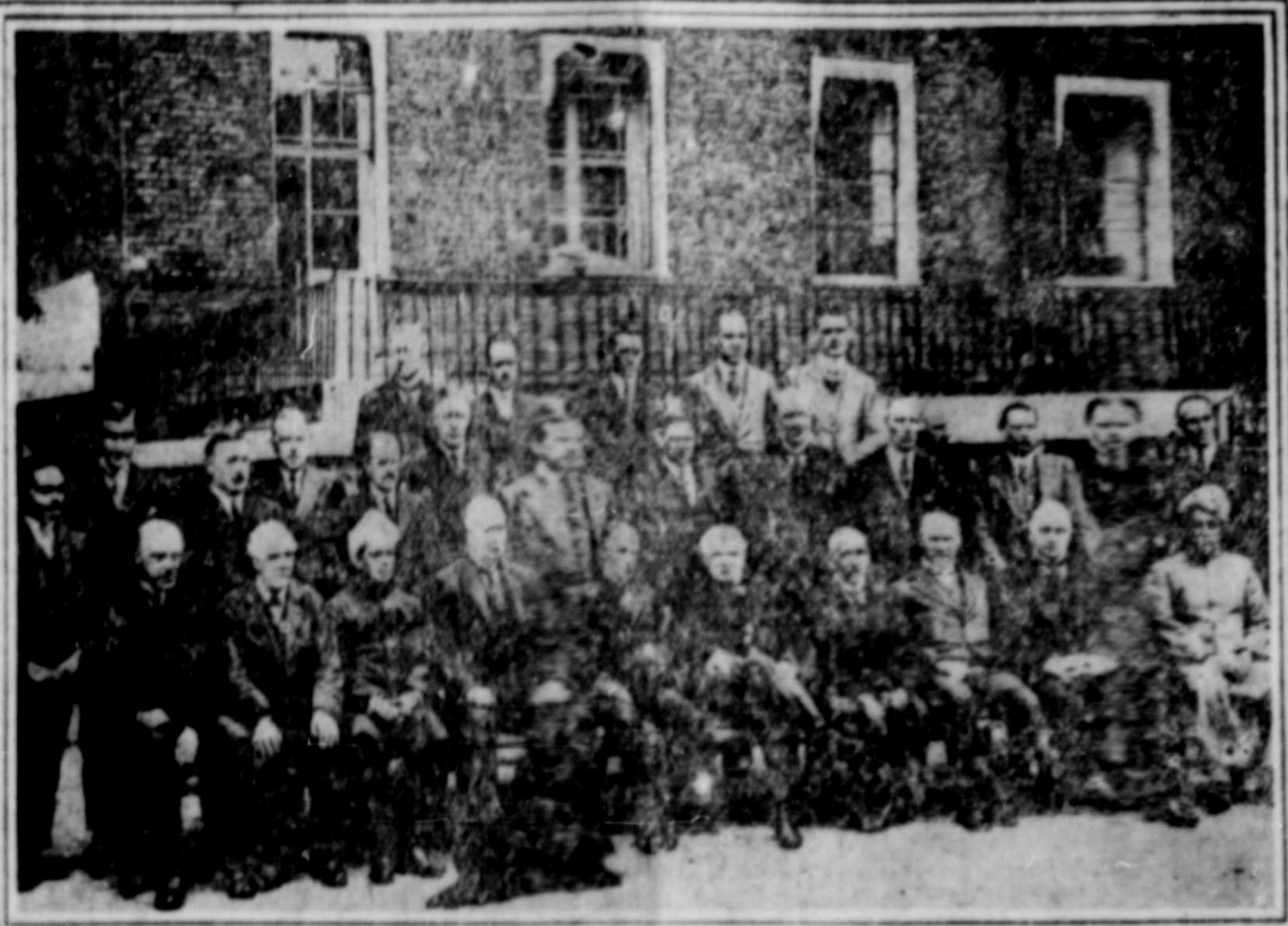
A specially posed photograph, taken at 10 Downing street, home of Lloyd George, showing the English Premier and the members of the Imperial Conference.