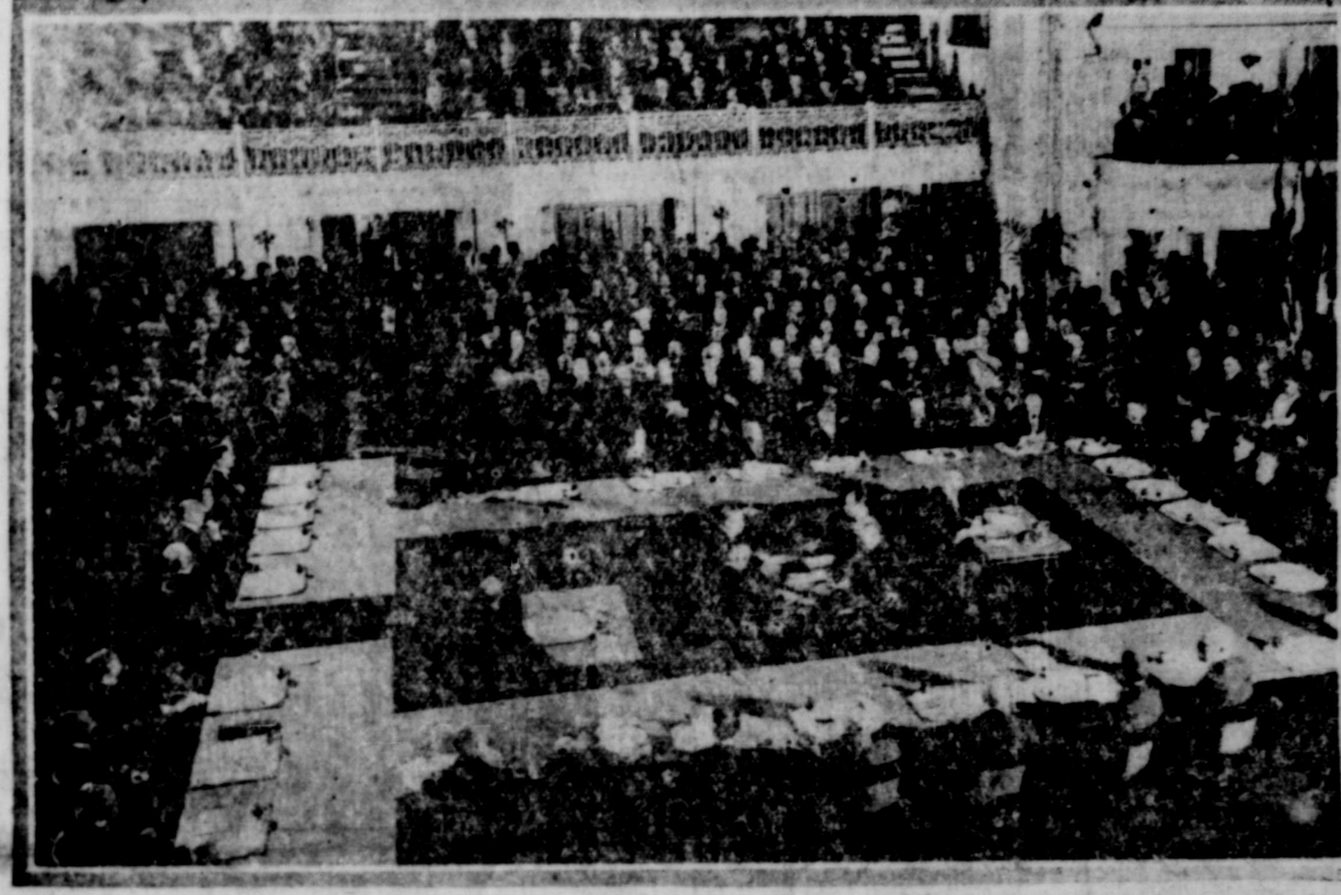
This very enlightening picture taken in Memorial Hall, Washington, by official photographer during the Conference on the Limitation of Armaments was taken just after Premier Briand of the French delegation had concluded his famous speech in which he declared that the French army halts a new war in Europe.