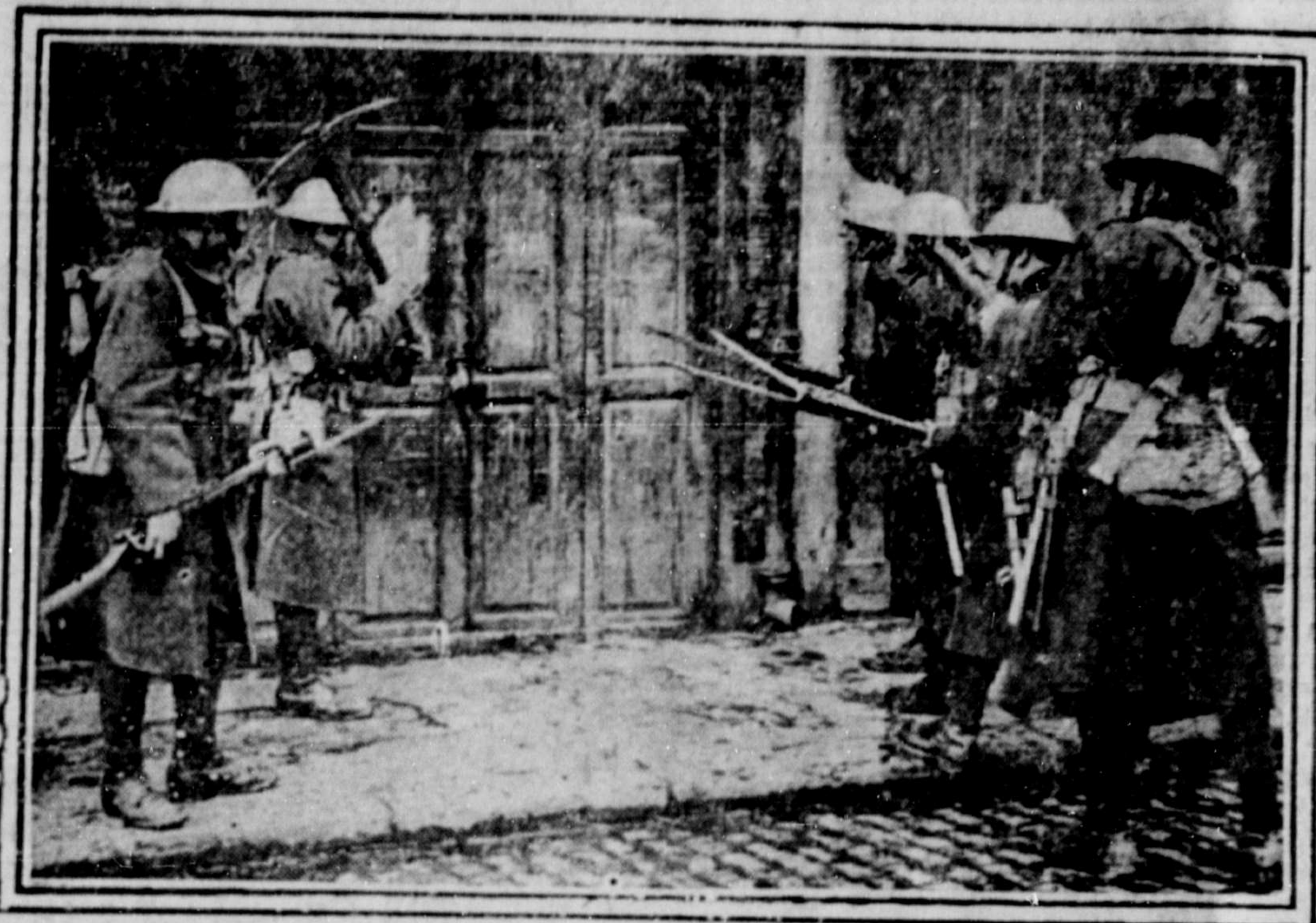
The photograph, a very recent one, shows British troops battering down a door with a pikeaxe in Dublin. These searching parties are all well armed and equipped. They are holding their bayonets in readiness in case any one makes a rush from within. Sinn Fein disorders seem to be increasing daily, and as many British guards as there are in the bigger cities of Ireland, fighting continues. In a recent raid British police and Sinn Feiners engaged in a pitched battle, in which many were wounded, between 100 and 250 Sinn Feiners taking part in the fighting. The din of the fighting could be heard more than nine miles away.