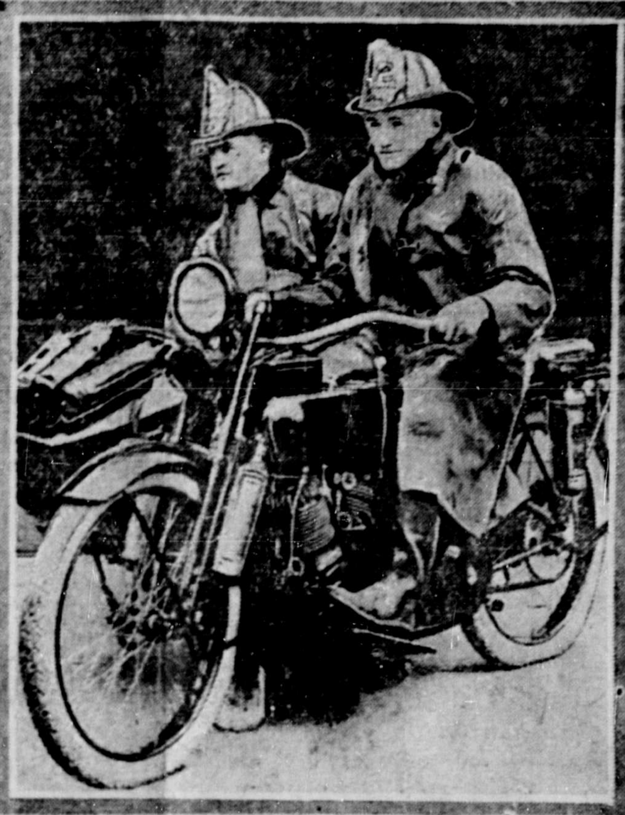
This motorcycle, bearing eight extinguishers and two firemen, was recently given a successful test in Milwaukee, Wis. It is able to reach a blaze much sooner than open motor drawn apparatus.