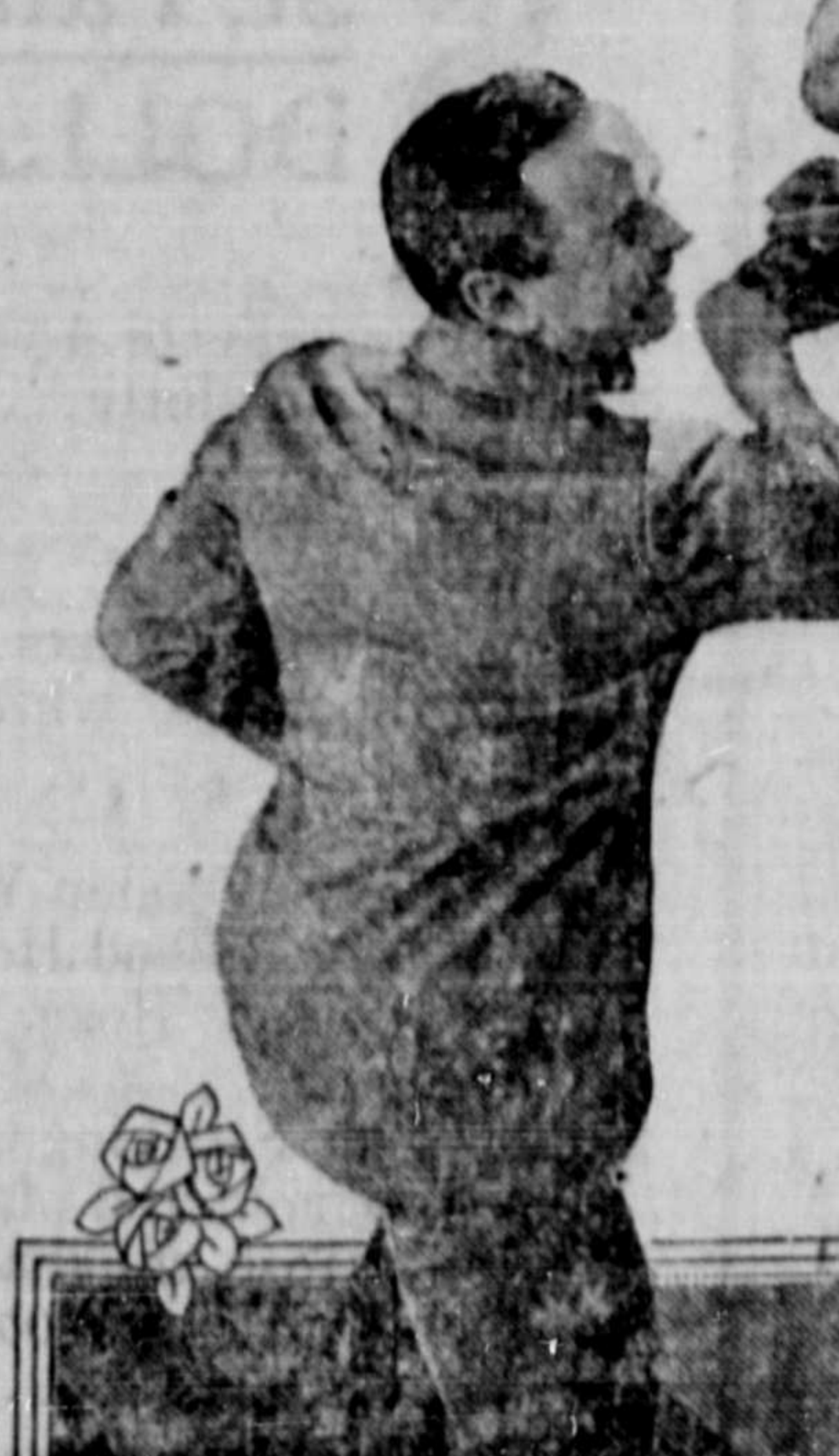
DOUGLAS FAIRBANKS in "When the Clouds Roll By" Starring tonight at the Westholme Theatre.

TIMES are bad, You can't deny it. We're blue by god, Do we believe it? And yet we see A silver lining To the dark cloud. All bright and shining.