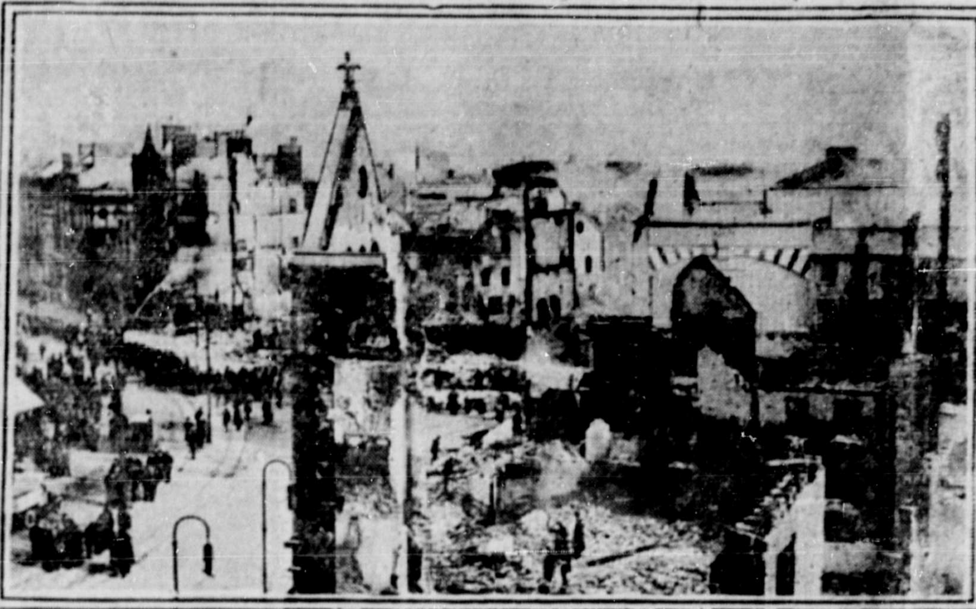
Views taken in Cork after serious outbreak in which many were killed and part of the city and its ruins after being swept by fire. The photograph shows one of the business sections after the fire.