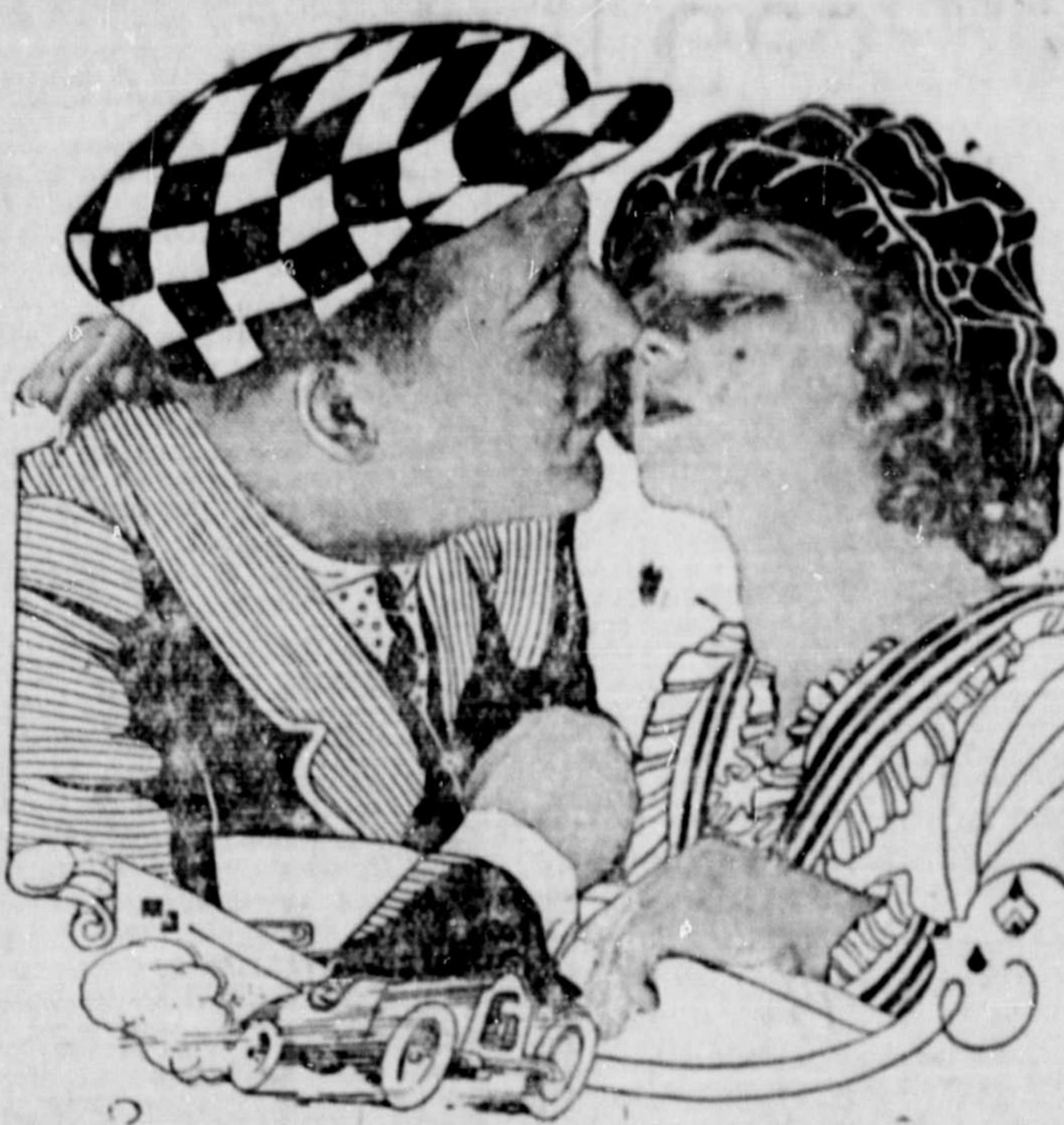
WALLACE REID and WANDA HAWLEY in a scene from "DOUBLE SPEED" A PARAMOUNT ARTCRAFT PICTURE