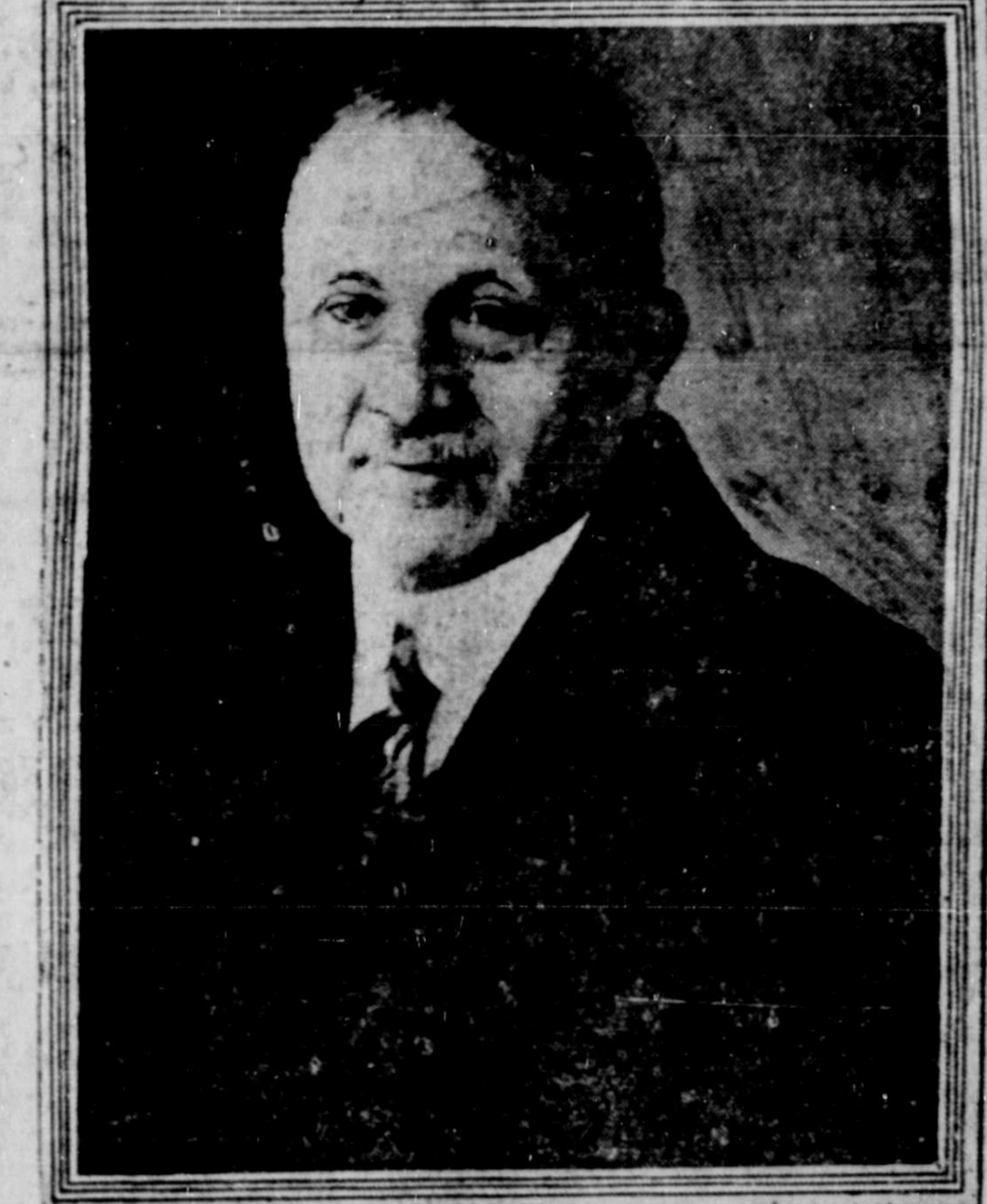
Rene Viviani, former French Premier, has just arrived in America as an envoy extraordinary from France with power to settle all war questions between the United States and France. This is the first time such an envoy has visited America from France since the war of the Revolution. The photograph of Mr. Viviani was taken upon his arrival on board the steamship Lorraine.