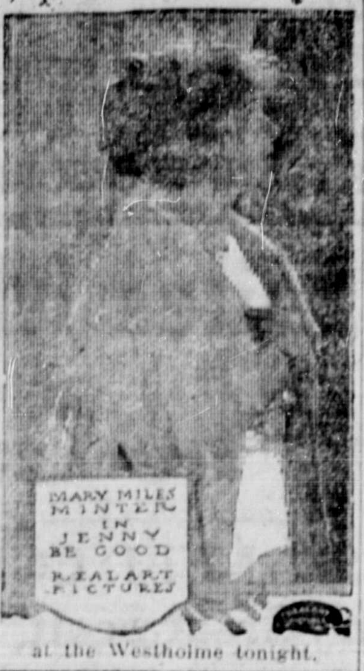
at the Westholme tonight.