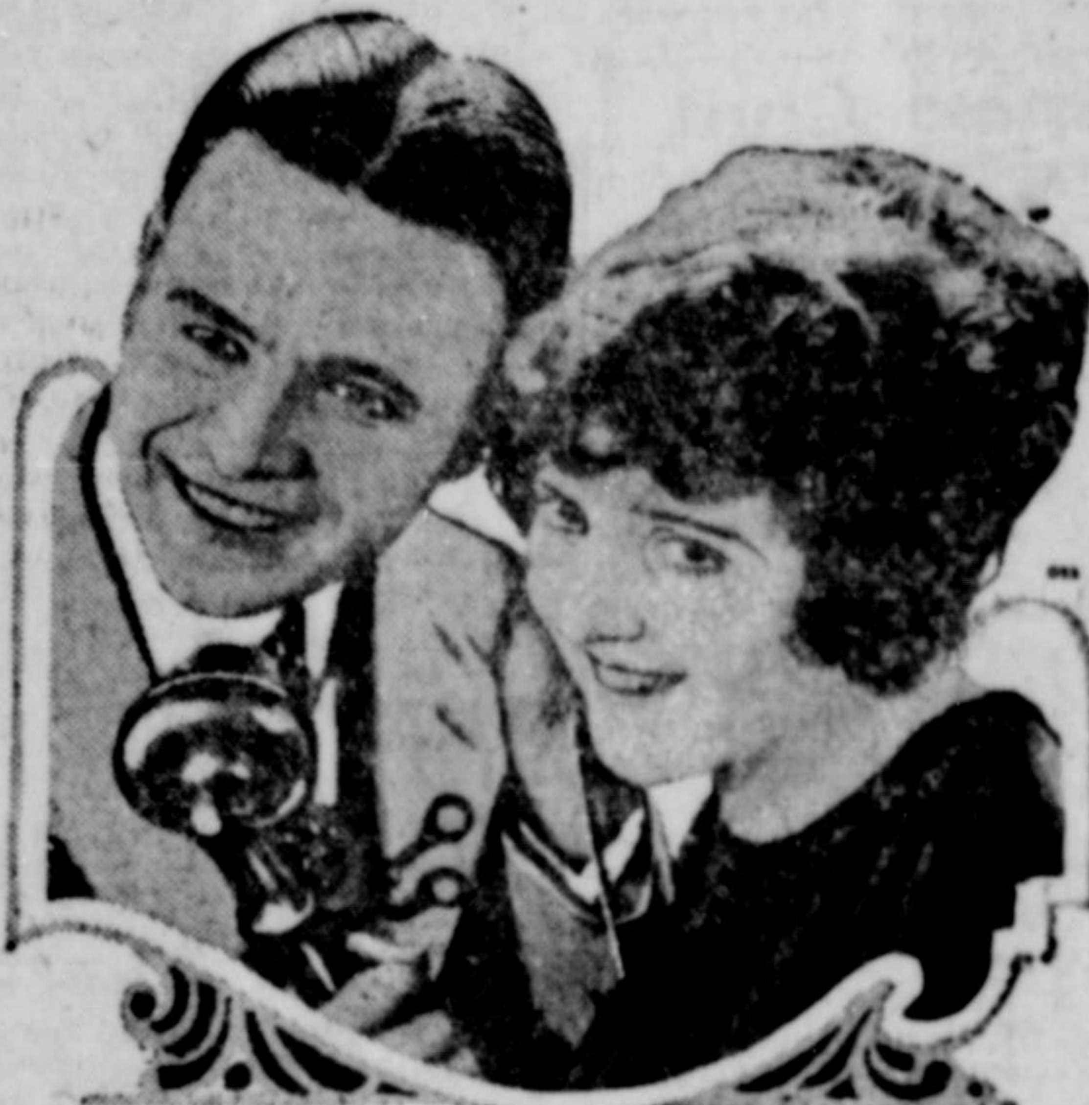
Douglas MacLean & Doris May in the Thomas H. Ince Production "The Rookies' Return" A Paramount Picture