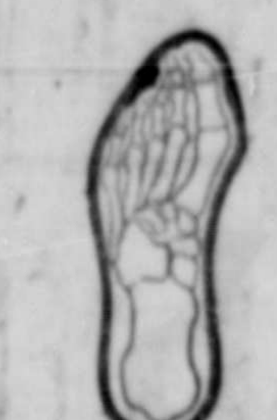
Original toes caused the foot to grow the Hurlbut way.