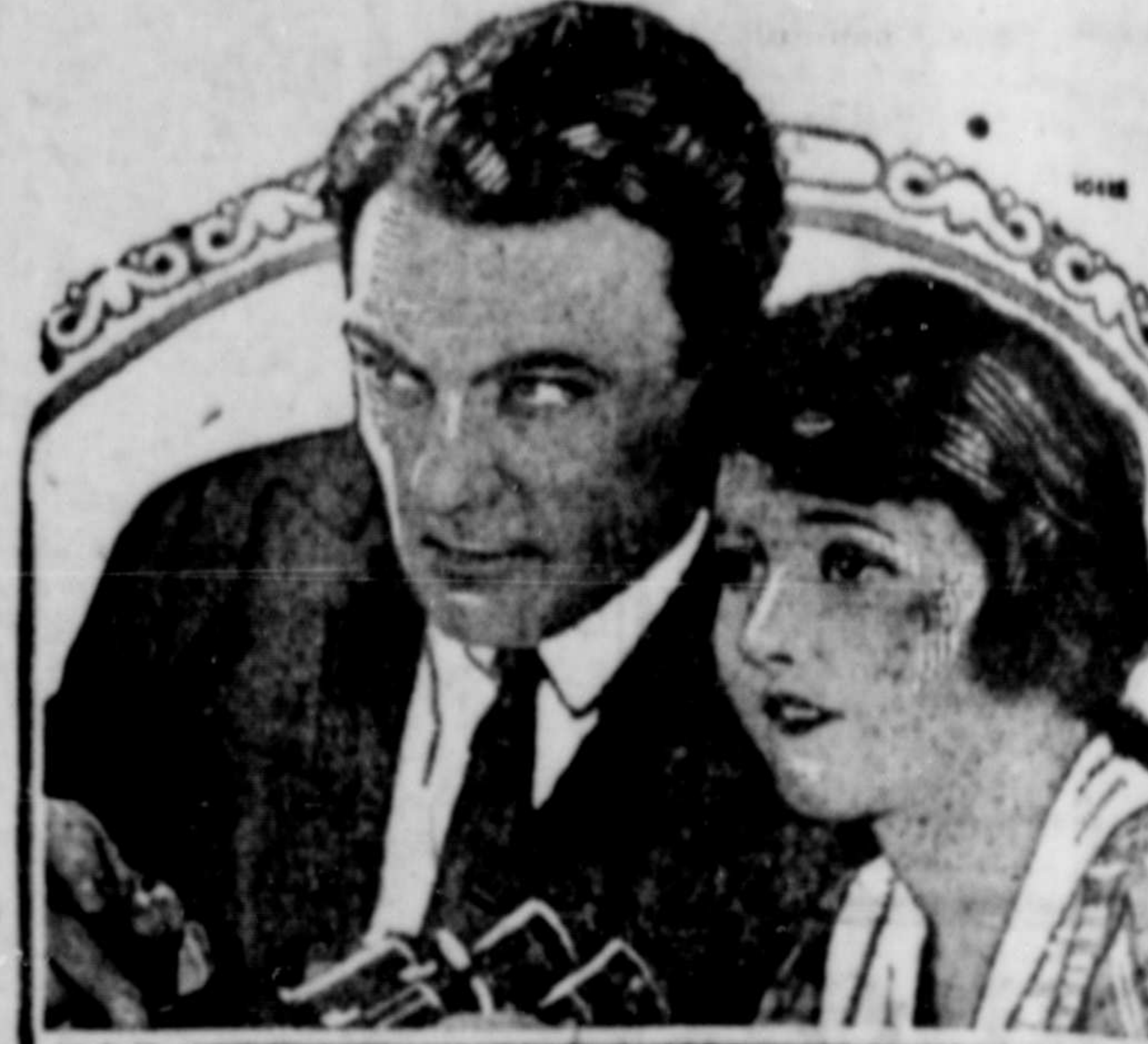
Thomas Meighan and Faure Binney in a scene from "The Frontier of the Stars" A Paramount Picture IN