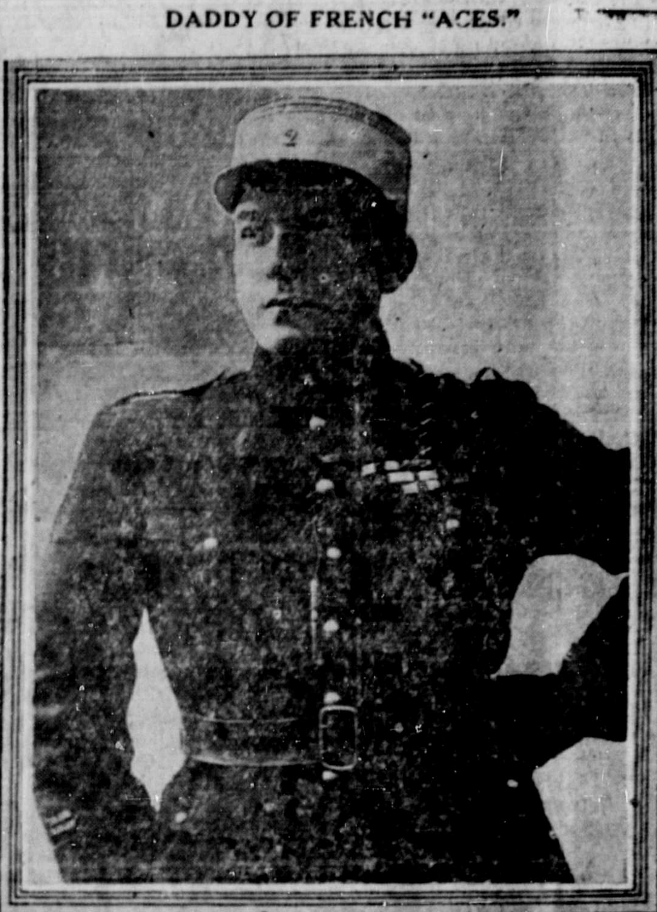
DADDY OF FRENCH "ACES"

VICTORIA, March 2.—The Provincial Government intends to carry out a broad policy of road construction and press road work in different parts of British Columbia, especially in the north, as fast as conditions will allow, Premier Oliver told the Good Roads representatives this morning.