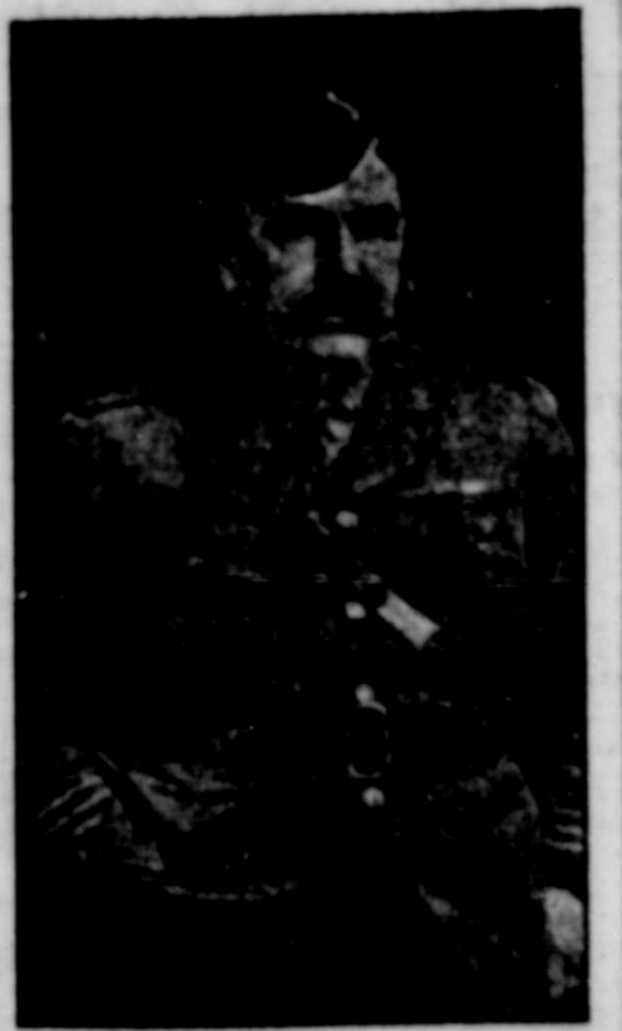
Former Member for District to Run as Independent.