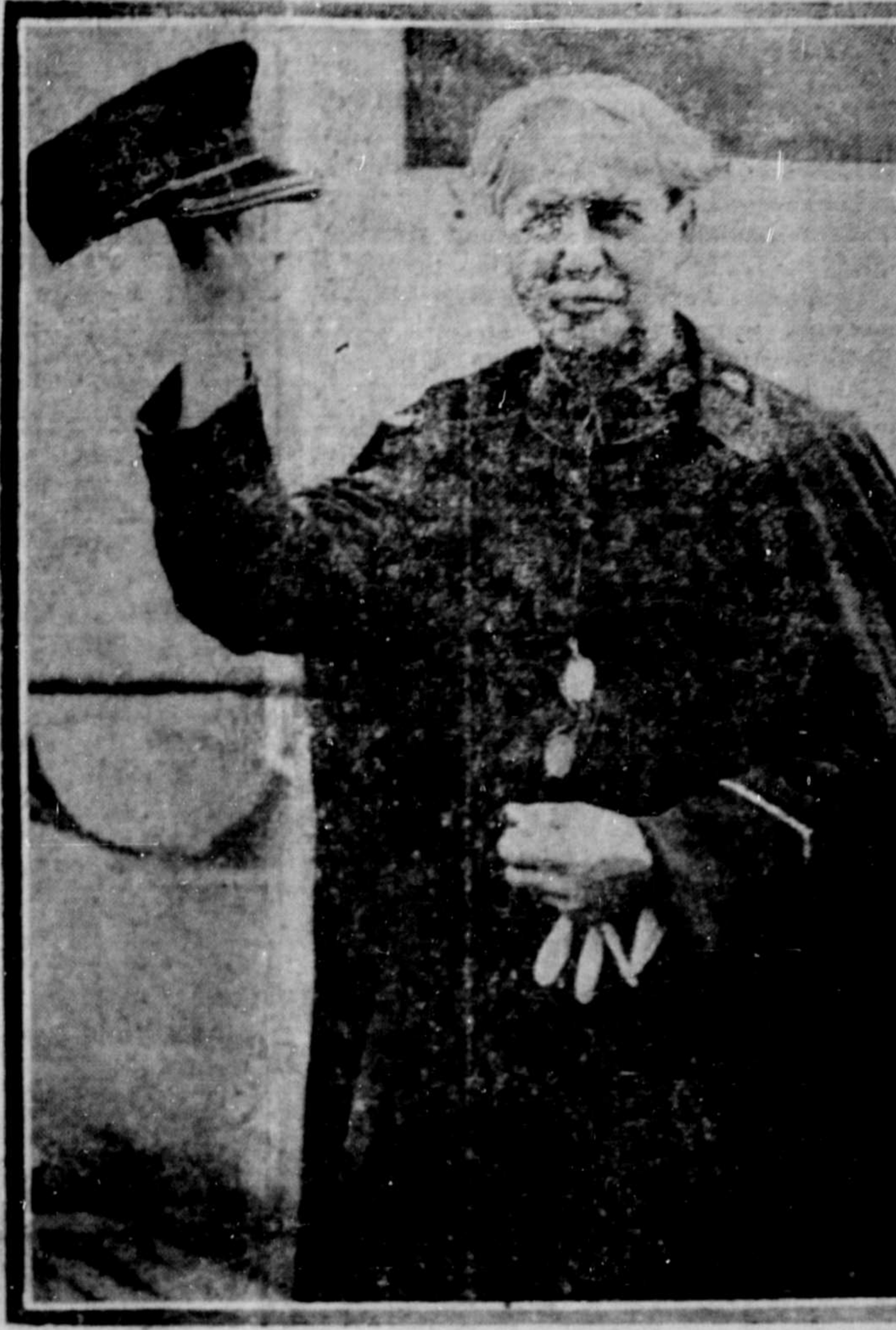
General William Brewster Booth, head of the Salvation Army, who is in America. He recently arrived and will soon go on an inspection tour.