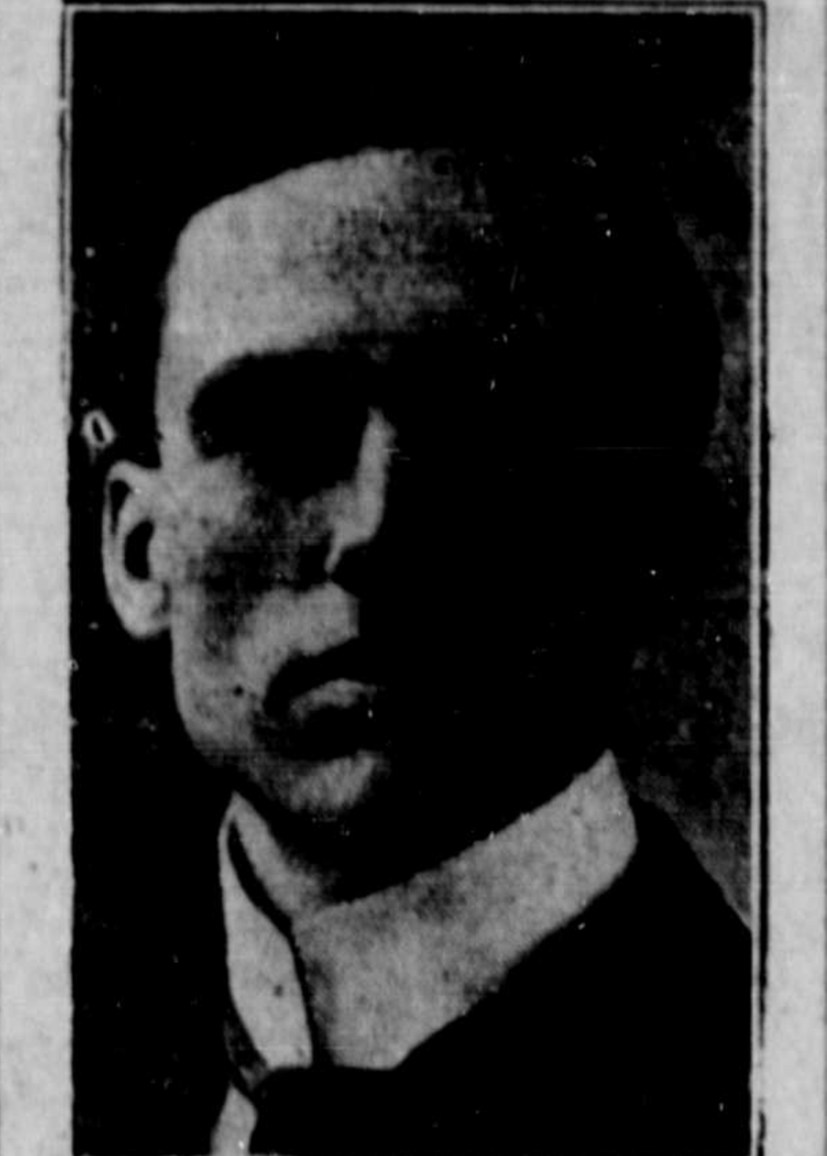
PREMIER MARTIN of Saskatchewan, who may appeal to the people of the province at an election soon.