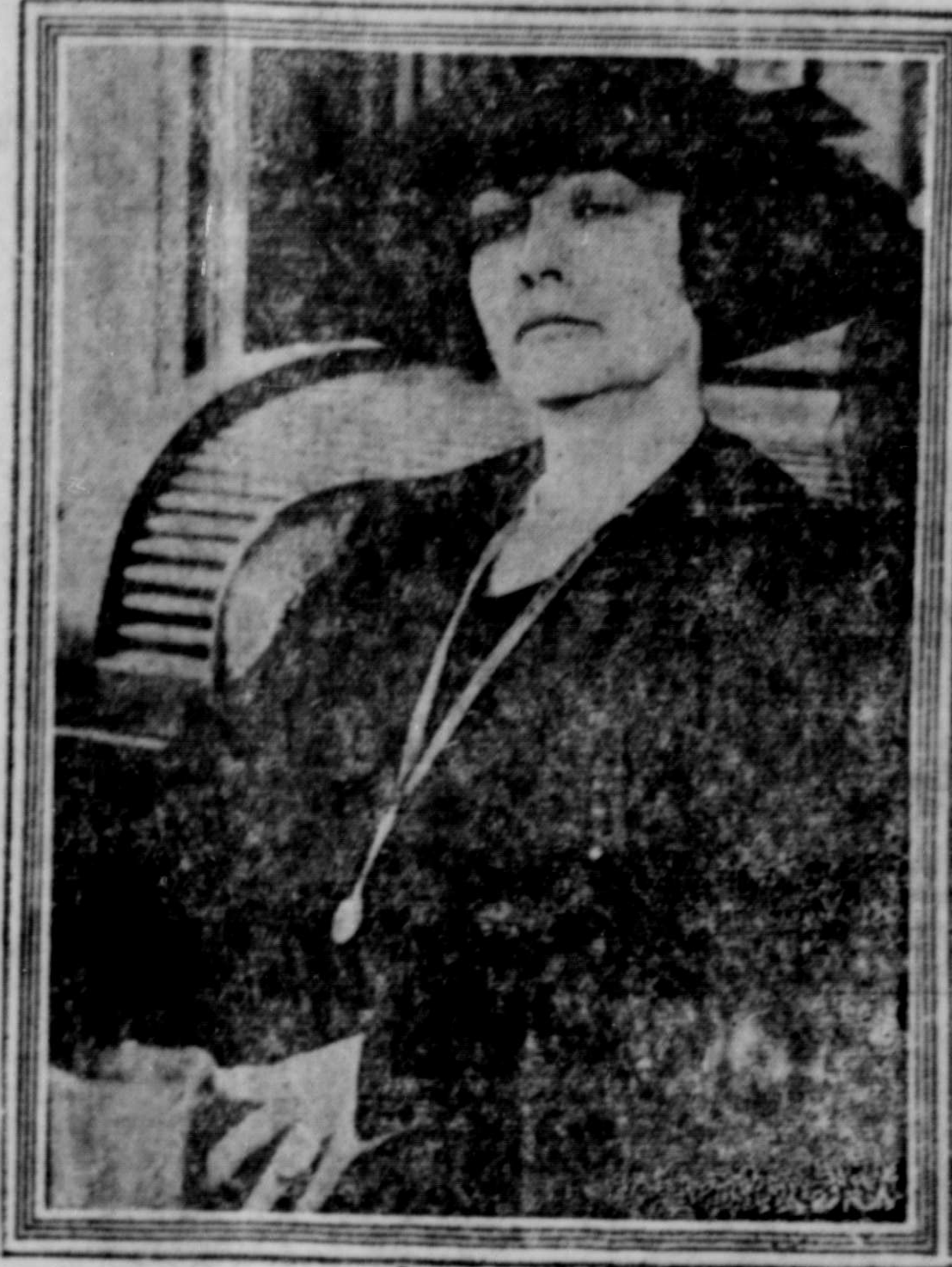
Here is Mrs. Bambi Maude Delmont, companion of Miss Virginia Lappe at the fatal Ar buckle booze party. She is the chief witness against him with murder.