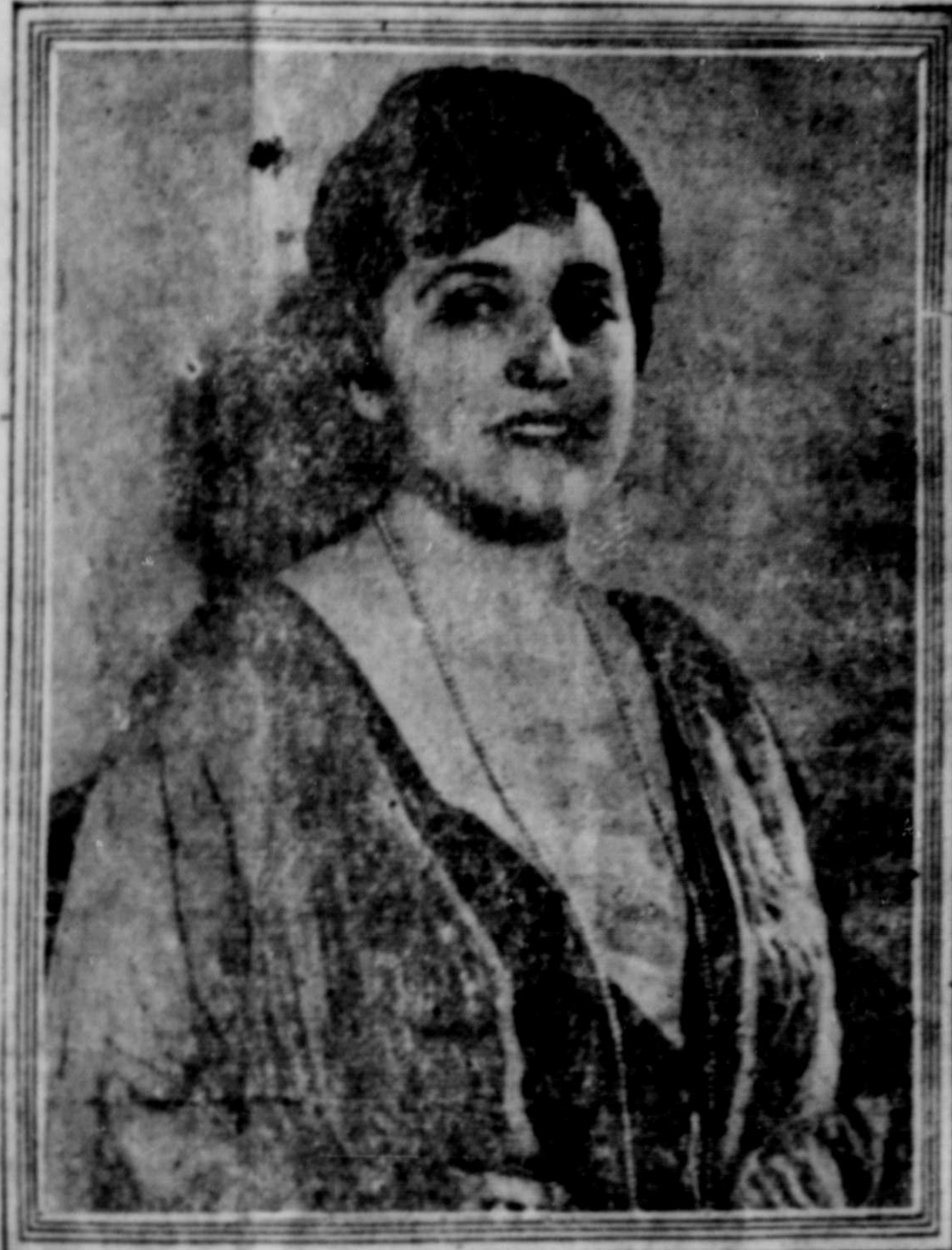
Mrs. Mary Roberts Rinehart, noted writer, is recovering from an operation which was performed in a New York sanitarium. She expects to be well in a few weeks, when she will again take up her pen and finish some stage and screen plays that she has under way.