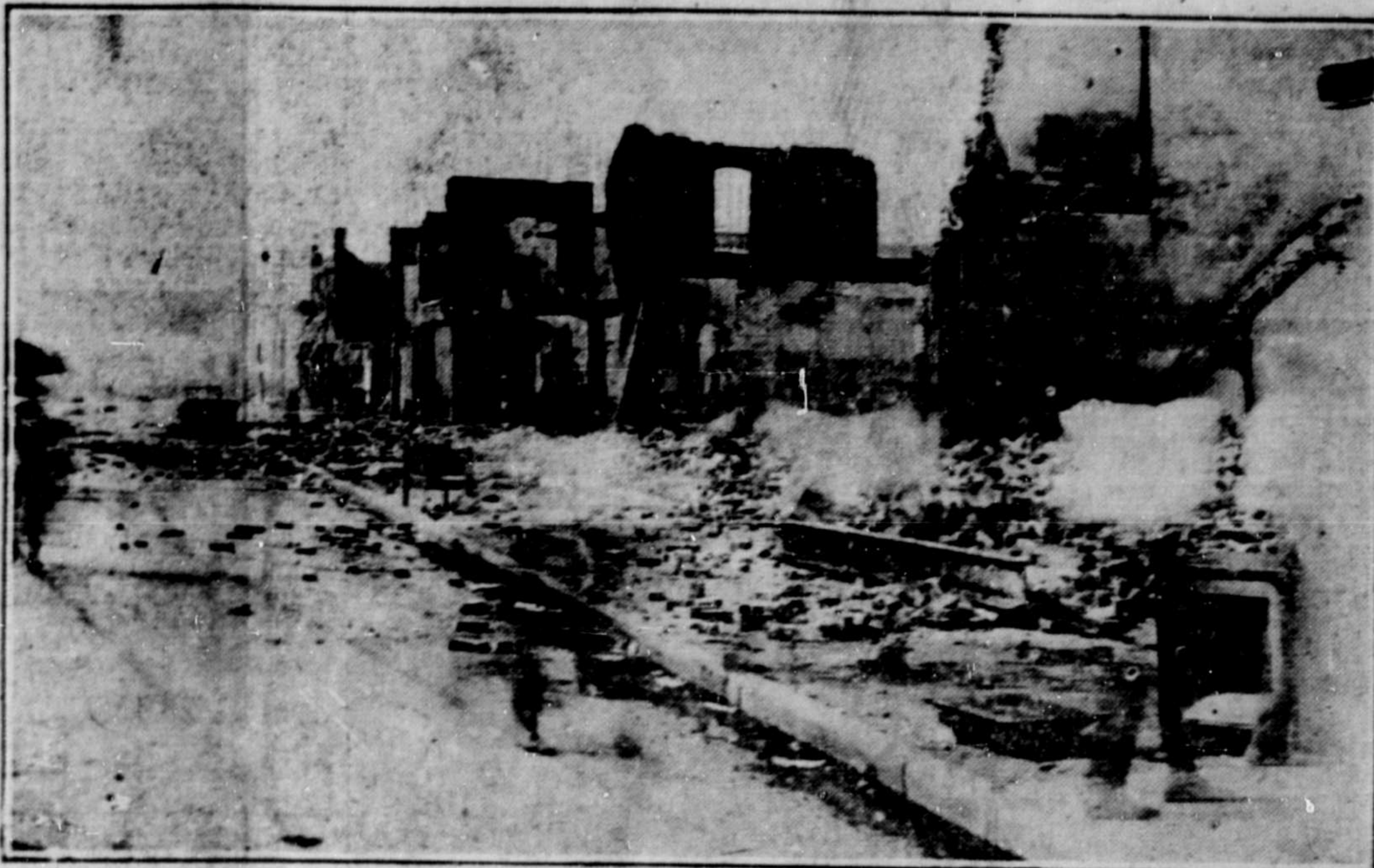
First pictures of the destruction wrought in Tulsa, Oklahoma, as the outcome of the race riot in which more than 25 persons were killed and many more injured. The photo shows part of the ten blocks of negro quarters that were burned to the ground.