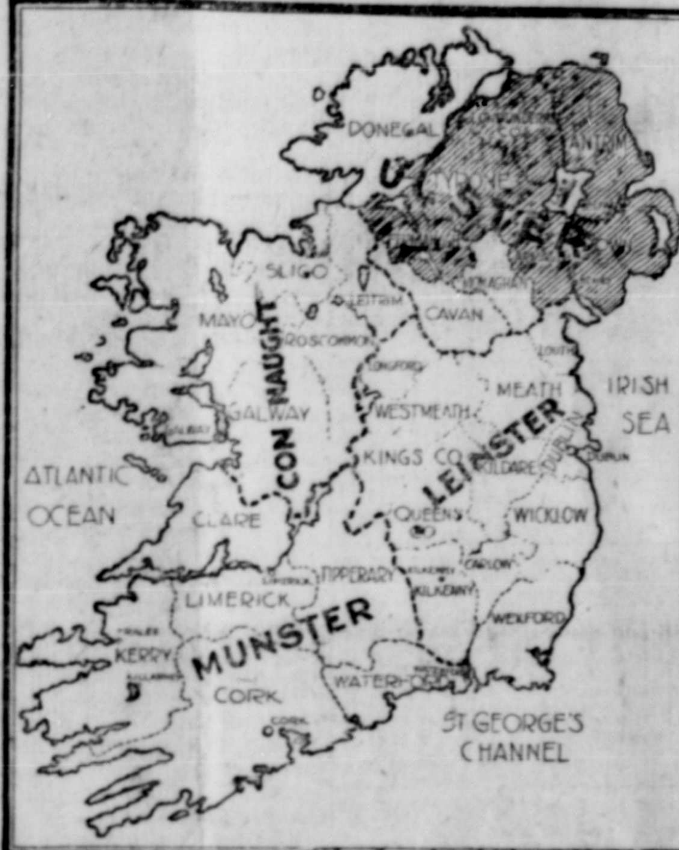
Map of Ireland showing the four provinces, of which the six northeastern counties form the Ulster portion, where a separate Parliament has been set up. The British Government virtually has yielded to all the demands of the Irish. None of the home rule items have been cut to three—decision on war or peace, armed forces and foreign relations.