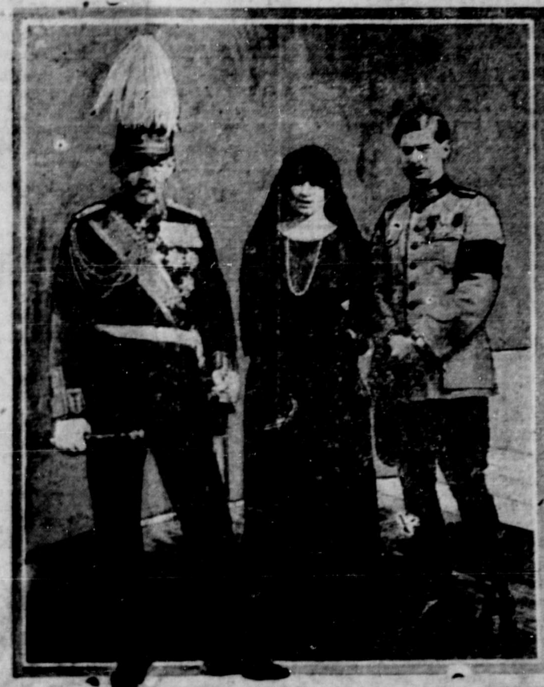
King Constantine, Princess Helen and Crown Prince Carol of Roumania, photographed on the royal palace grounds in Athens. Prince Carol and Princess Helen will soon be married.