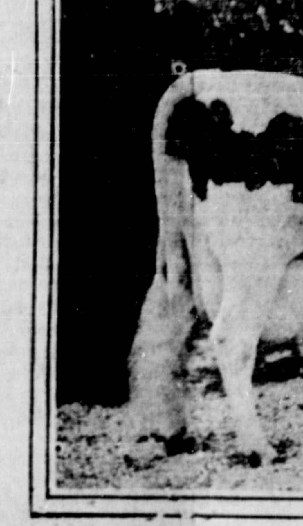
Segis Pietertje Prospect, who has broken all records by producing 27,381.4 pounds of milk and 1,448.68 pounds of butter in 365 days, thus establishing a new "world's record" 4,000 pounds greater than the former one. This is sufficient milk to furnish the milk supply of 33,406 persons for a day, using the government capita consumption of figures, seven-tenths of a pound per day.

Champion Hockey Team of East will Play Vancouver or Seattle.