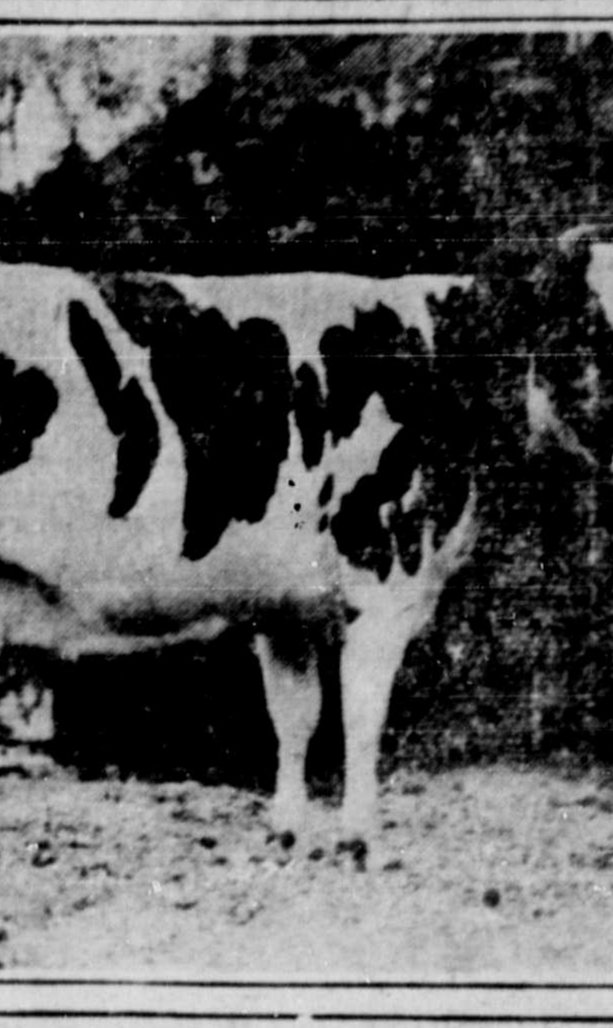
Segis Pietertje Prospect, who has broken all records by producing 27,381.4 pounds of milk and 1,448.68 pounds of butter in 365 days, thus establishing a new "world's record" 4,000 pounds greater than the former one. This is sufficient milk to furnish the milk supply of 33,406 persons for a day, using the government capita consumption of figures, seven-tenths of a pound per day.