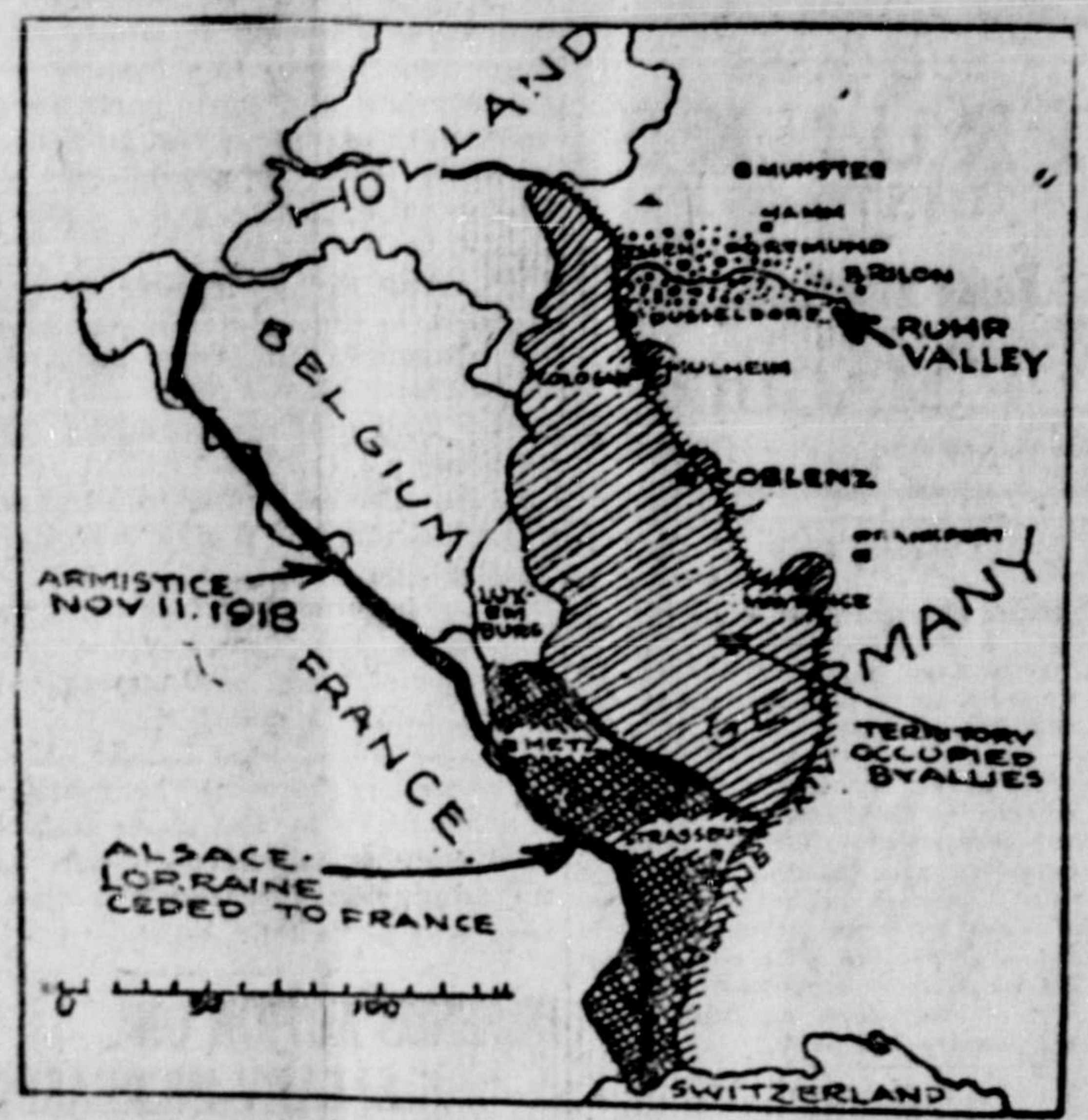
Reason of the Ruhr Valley by an allied or a French force would involve the dotted area on this map and would include the import of city of Essen, home of the Krupp works. The French are now but a few miles from Essen. The dotted portion of the map shows the present extent of the allied occupation.