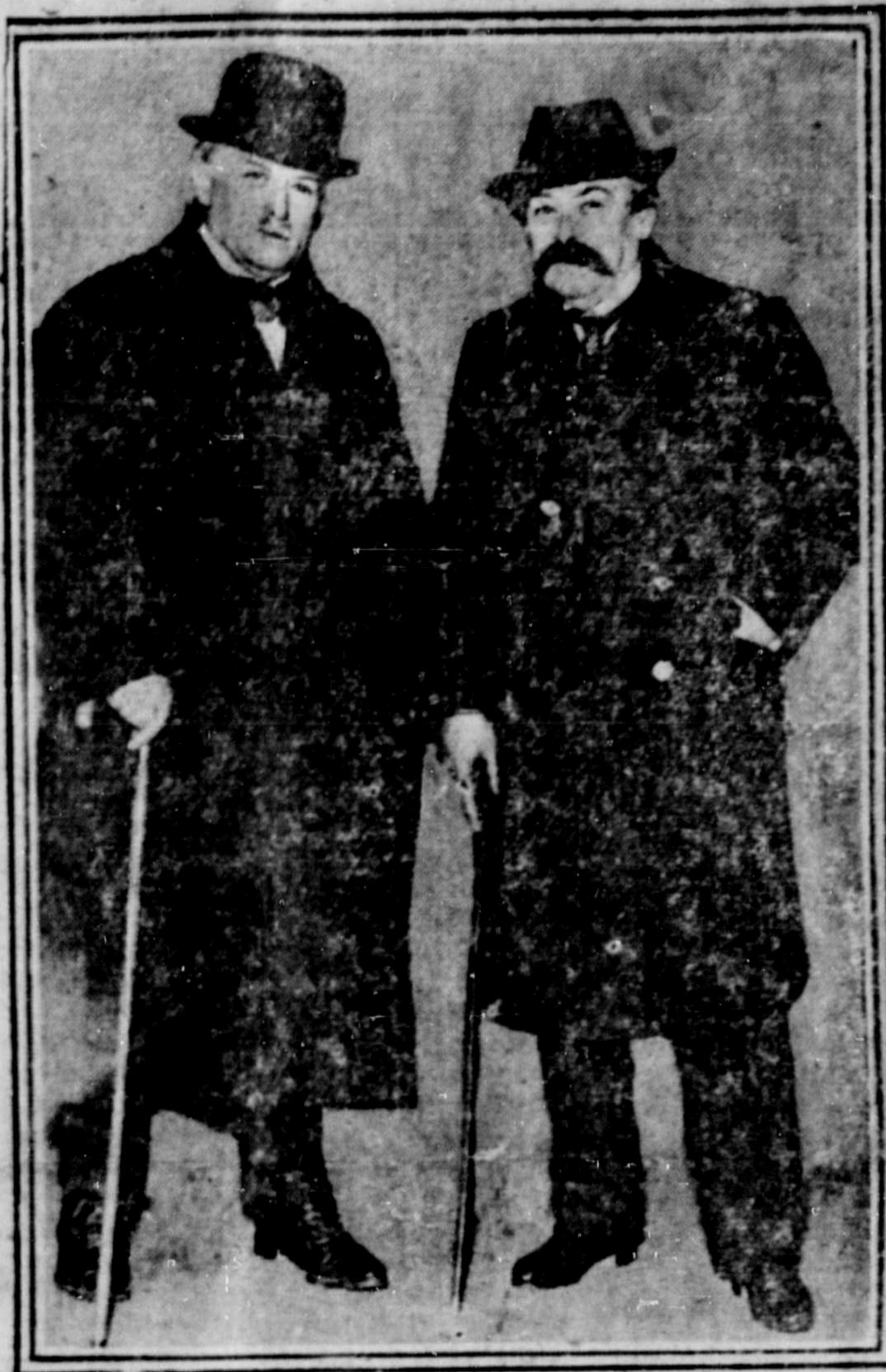
M. Briand, the French Premier, photographed with Lloyd George, Britain's Prime Minister, in London a short time ago. M. Briand is on the left.