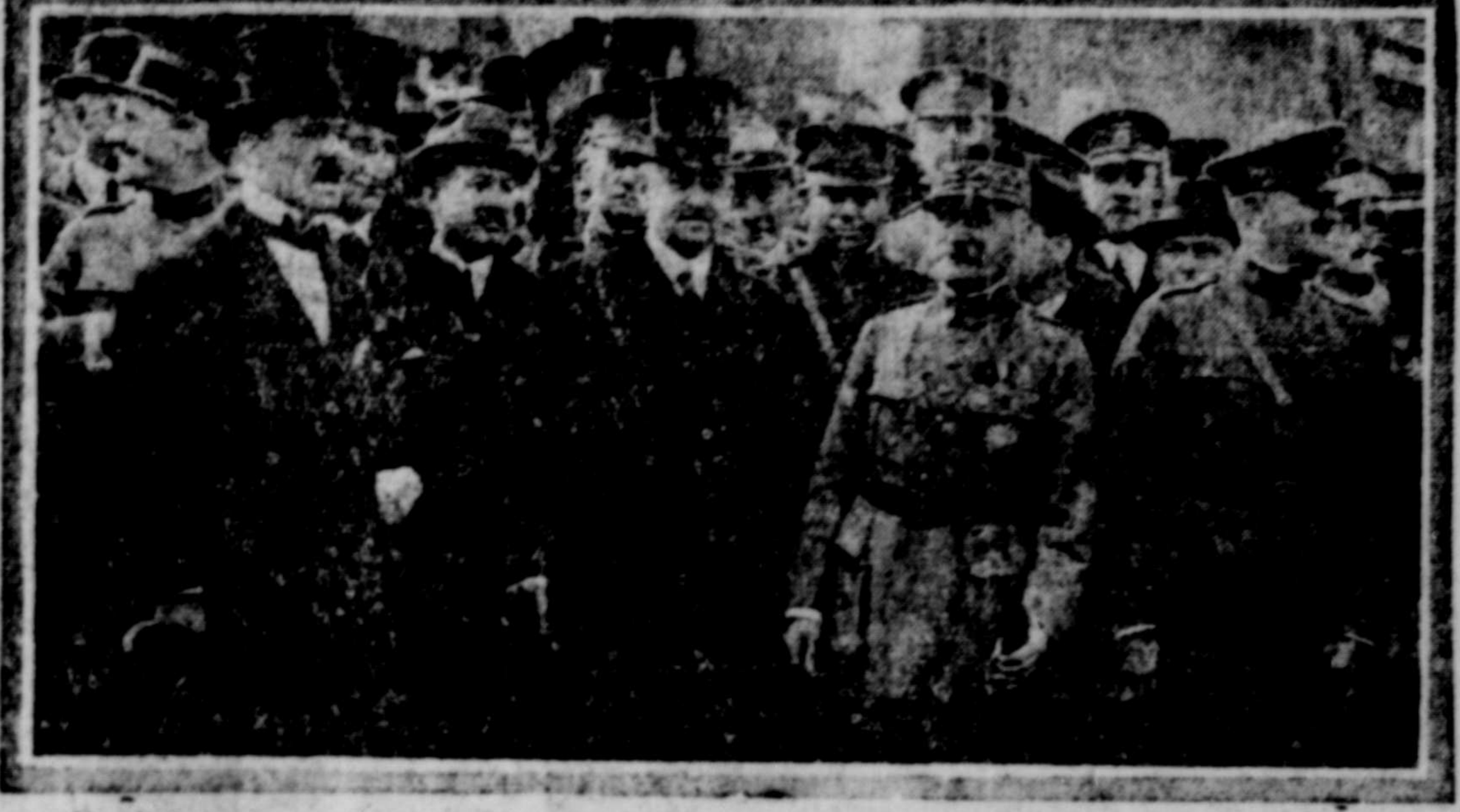
Marshal Ferdinand Foch, Commander-in-Chief of the allied armies during the world war, was greeted by more than 100,000 cheering people when he landed at the Battery in New York city. He was met by General Pershing, who welcomed him to America on behalf of the army, and Governor Miller of New York, as well as several other noted dignitaries. He will attend the American Legion convention.