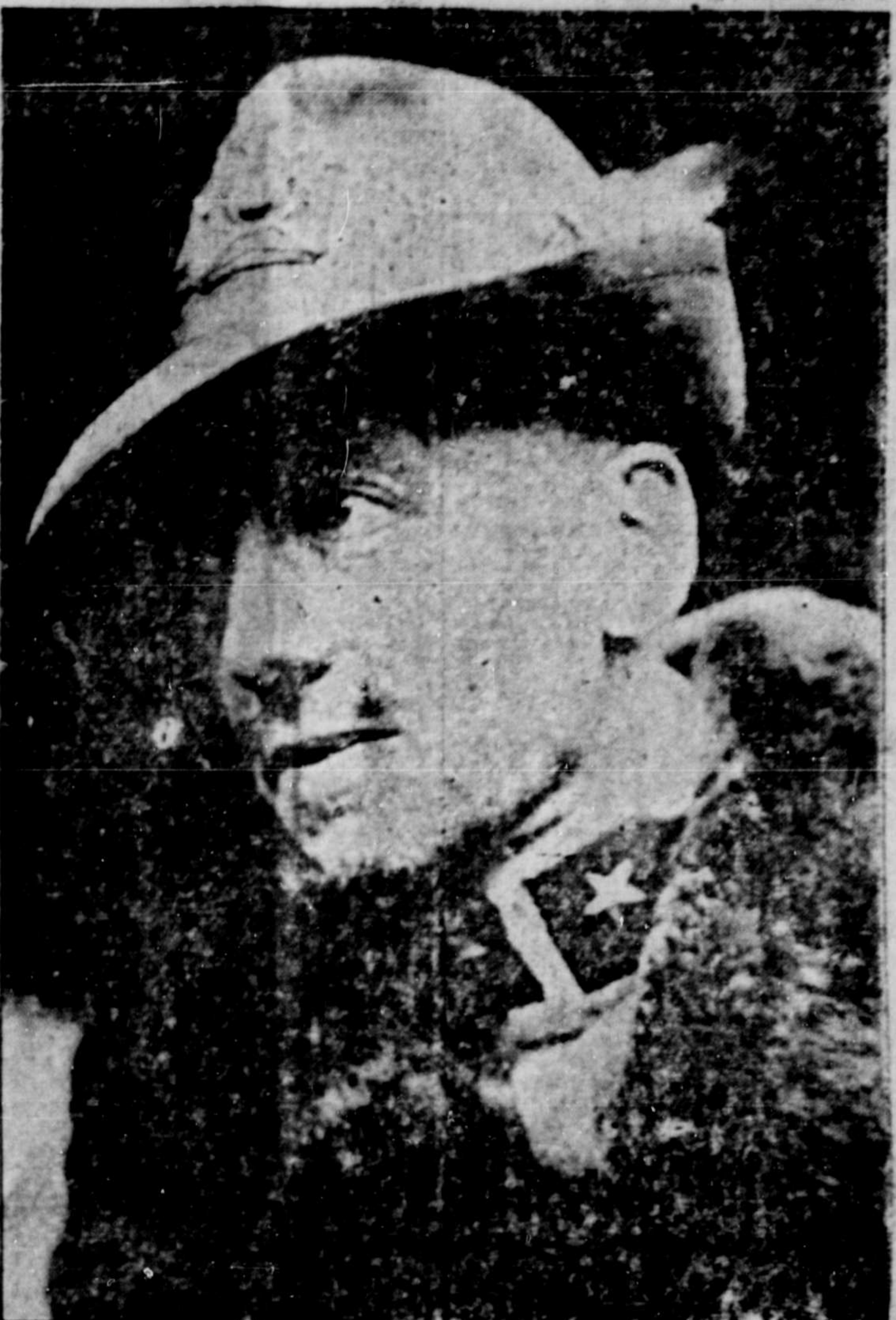
GABRIEL D'ANNUNZIO, Famous Italian Novelist, who is just married to a woman who supported him during his Fiume escapade.

DUBLIN, April 19.—The crown forces surprised a party of armed civilians drilling on the green at Ballymurphy. Five citizens are believed to be killed, two were wounded and six captured. The crown forces sustained no casualties.