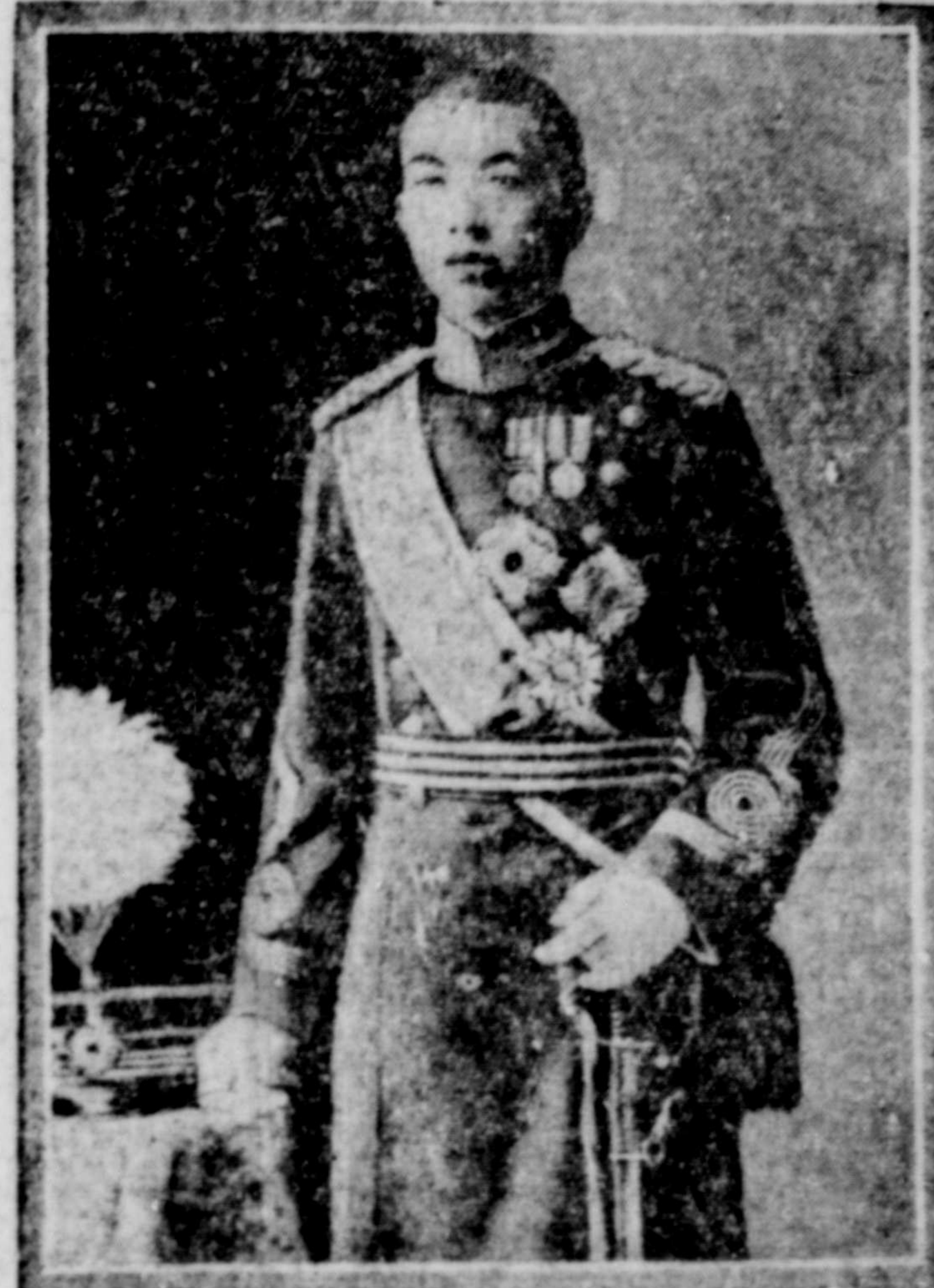
Crown Prince Hirohito has been appointed Regent to the emperor of Japan, who has been failing in health for some time. The Regency is expected to have the most far reaching consequences.