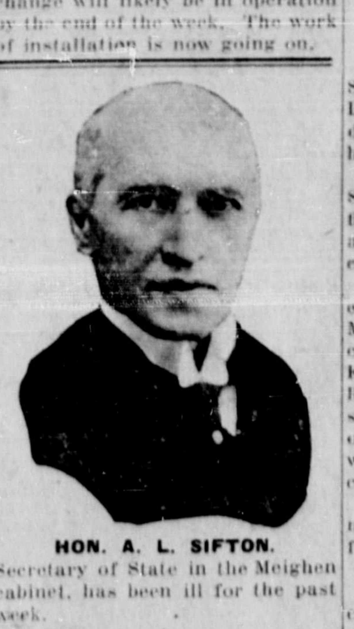
HON. A. L. SIFTON. Secretary of State in the Meighen cabinet, has been ill for the past week.

The first private telephone exchange branch of its kind in the city is being installed at the plant of the Canadian Fish and Cold Storage Co. and this morning the outfit was taken to Seal Cove by Superintendent T. C. Duncan. The new exchange will have at least ten stations with a capacity for thirty and will connect the various departments at the Cold Storage plant from one central number on the city exchange. On calling the Cold Storage number from the city a private operator in the Cold Storage building will connect the subscriber with the department called. Any phone inside the plant will be able to speak to another department by simply calling the Cold Storage central and being connected without a call to the city central. The new exchange will likely be in operation by the end of the week. The work of installation is now going on.