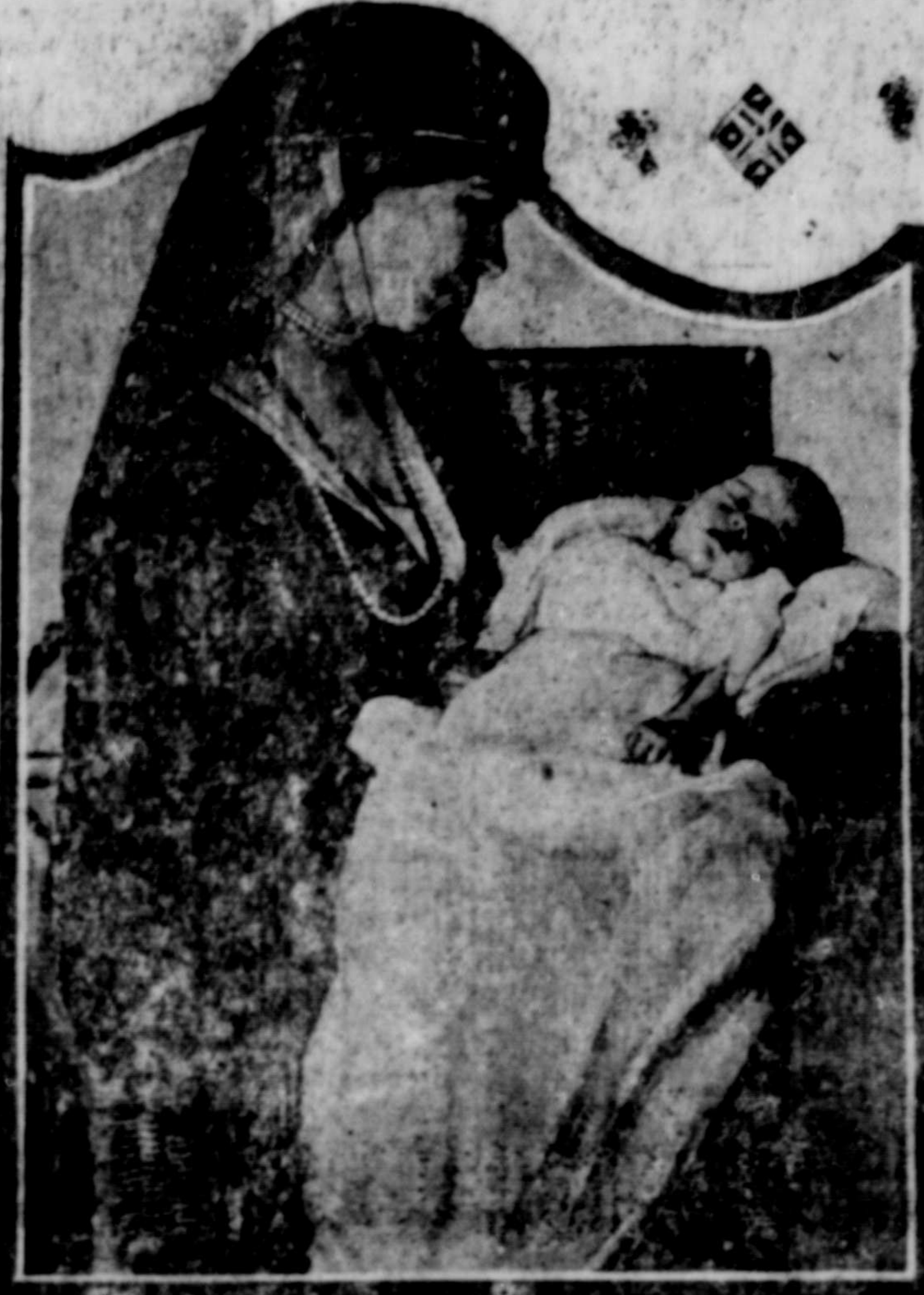
The Greek Government is planning to bestow a title on the widow of King Alexander and her offspring, despite the former opposition to the Prince's Parisian romance with Mme Manos.