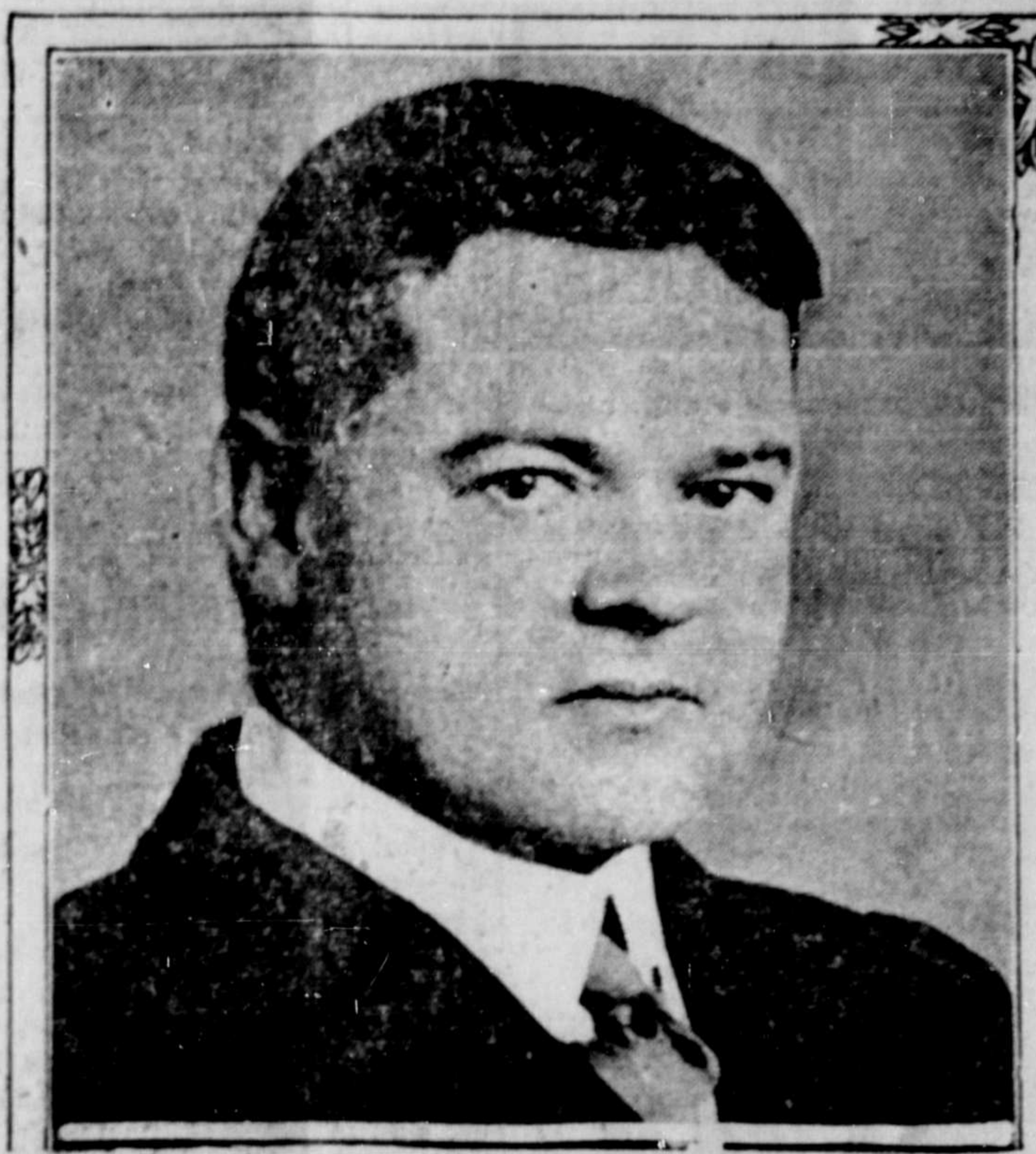
HERBERT HOOVER Appointed a Member of New Harding Cabinet