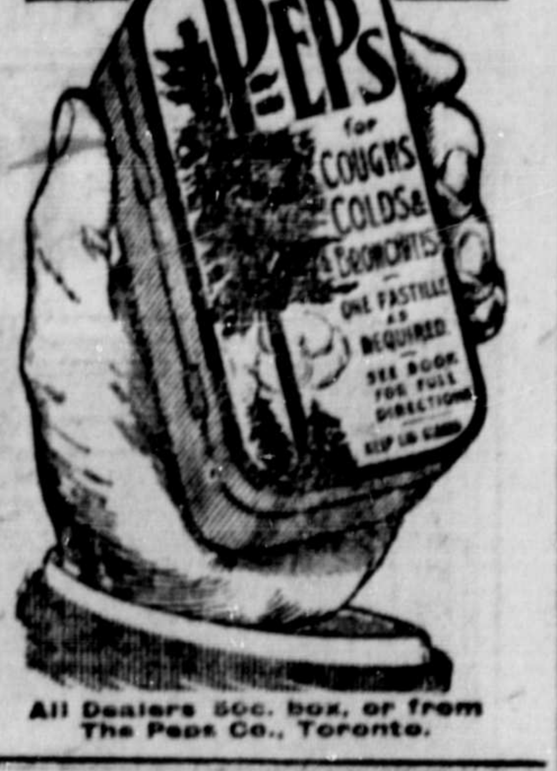
All Dealers 50c. Box, or from The Peep Co., Toronto.