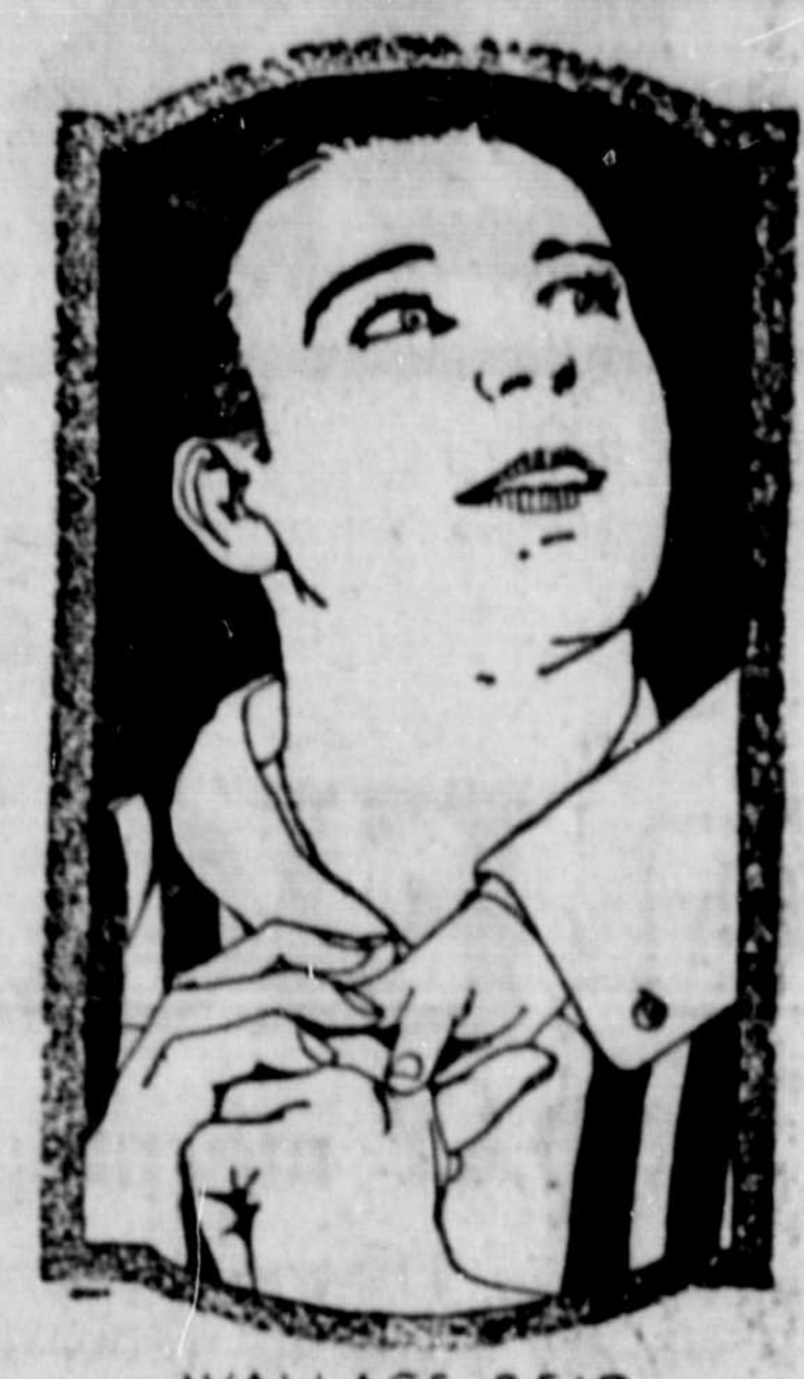
WALLACE REID in "SICK ABED" A PARAMOUNT ARTCRAFT PICTURE

The most popular man on the stage today. Wallace REID