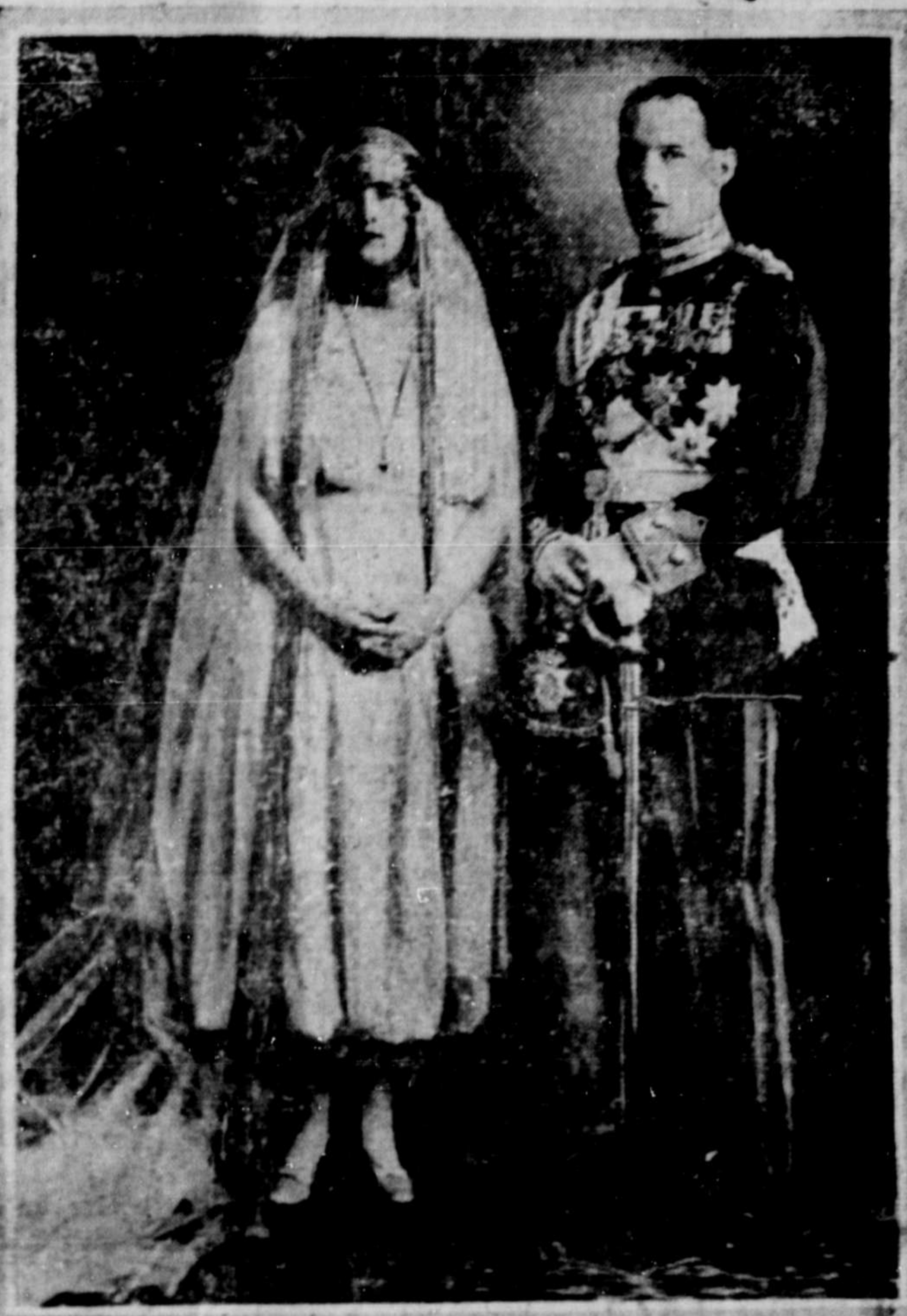
Crown Prince Carol of Greece and the Princess Elizabeth of Roumania photographed just after their wedding ceremony. That their marriage would take place had been the rumor for months, and it was therefore no surprise when made public.