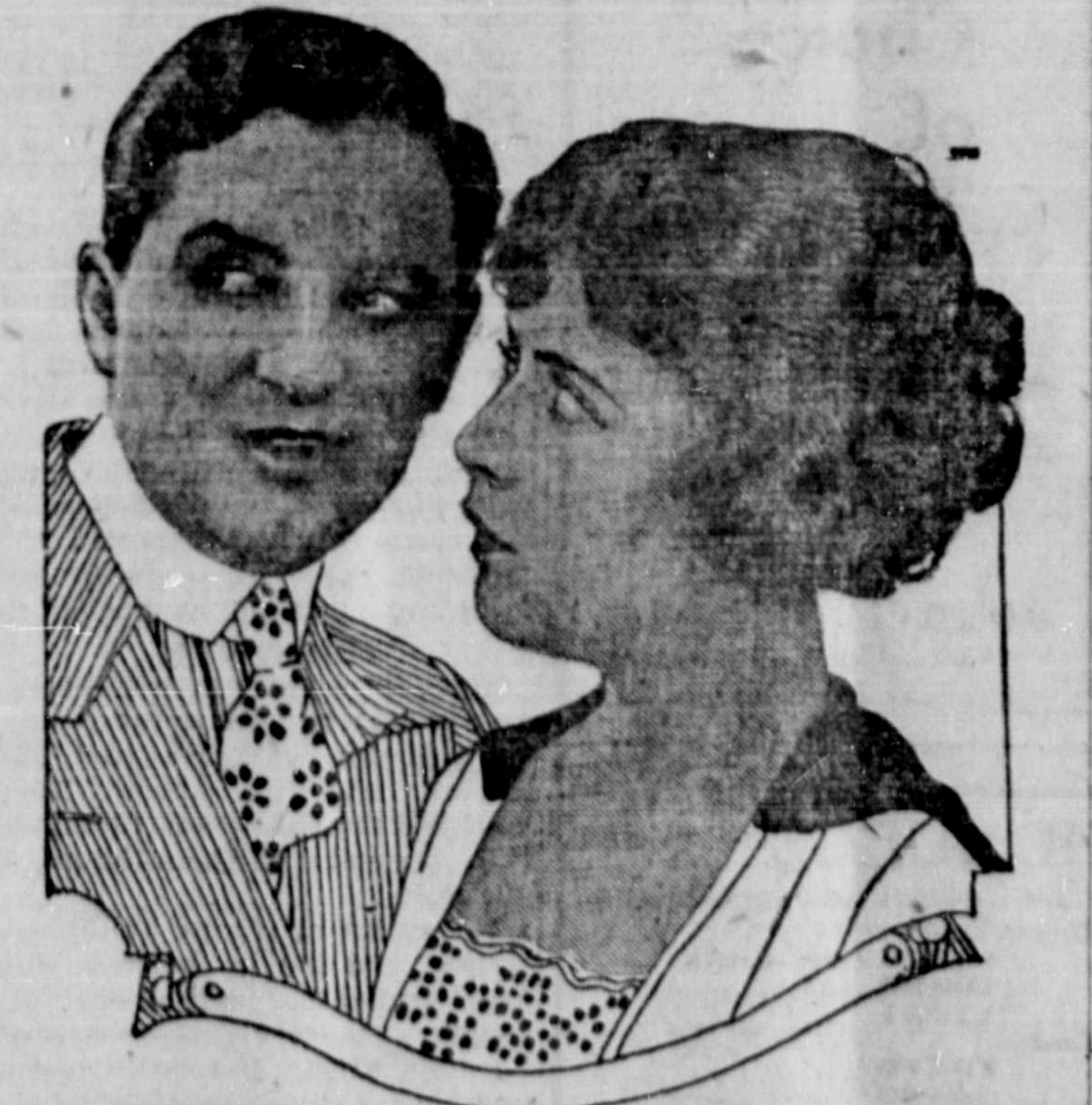
BRYANT WASHBURN and LOIS WILSON in a scene from 'TOO MUCH JOHNSON' A PARAMOUNT ART-CRAFT PICTURE. At the Empress Theatre tonight.

About one hundred couples attended the dance given in the St. Andrew's Hall on Thursday night by the Ladies' Auxiliary of the St. Andrew's Society. The affair proved both successful and enjoyable.