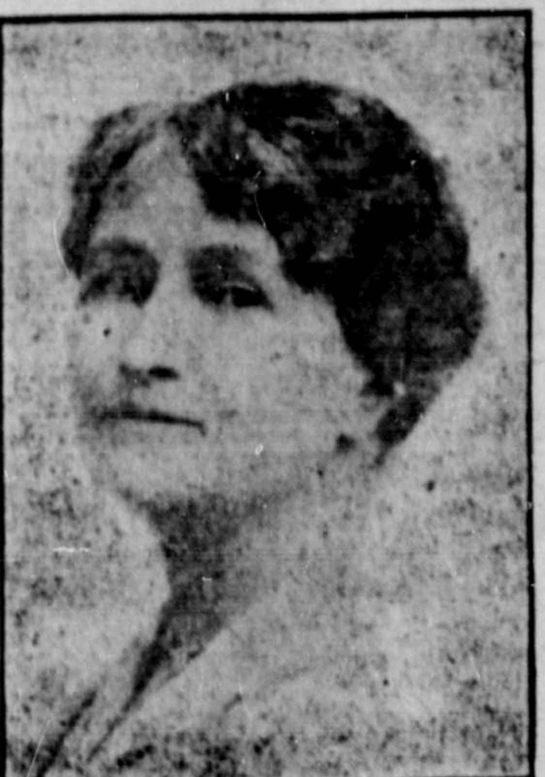
HON. MARY ELLEN SMITH, First woman in Canada to be ad- mitted to the inner councils of a provincial government, is presi- dent of the council in the Oliver Government.