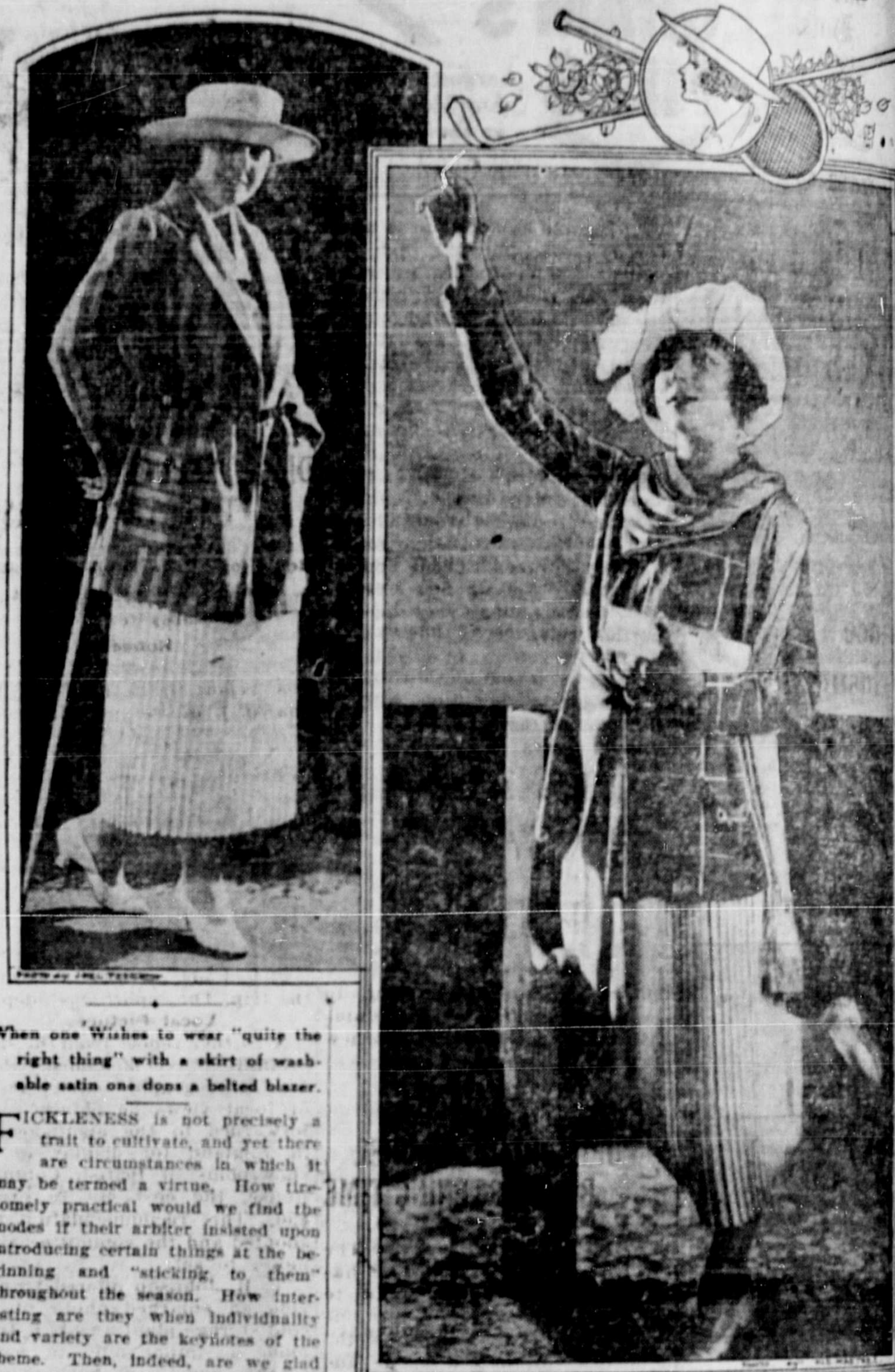
Delightfully girlish is this picturesque affair—the skirt with a plaid panel at the side, the jacket plaited and long as to drape.

Infinite is the Variety in Out-of-Door Apparel—At Fashion's Caprice, Personality Finds Expression in Color and in Line.