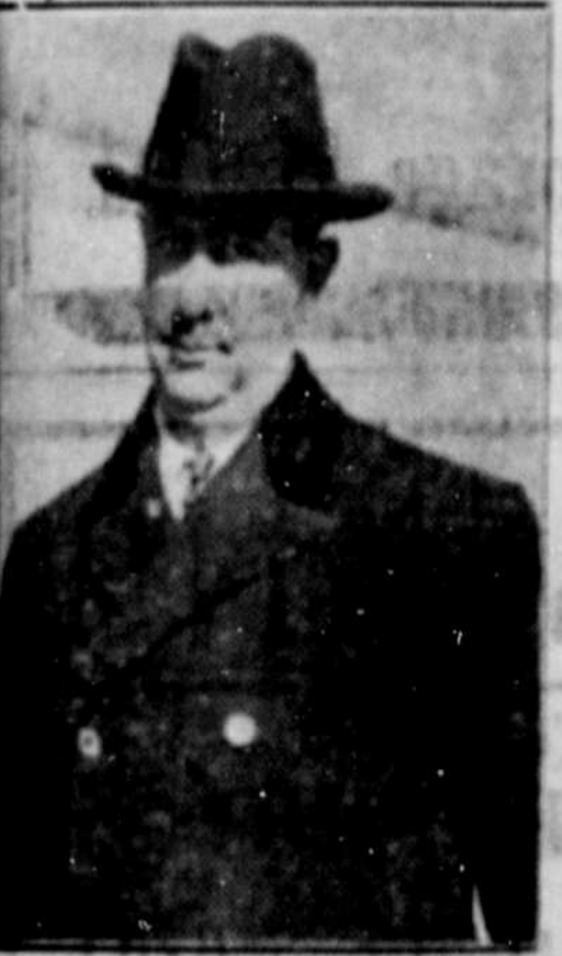
SIR ARTHUR CURRIE

Along with the idea for Imperial Unity and Dismissal of Separatist Propaganda was the keynote of an address delivered by General Sir Arthur Currie at a Canadian Club luncheon at the Windsor Hotel, on the occasion of the annual meeting and final session of the club.