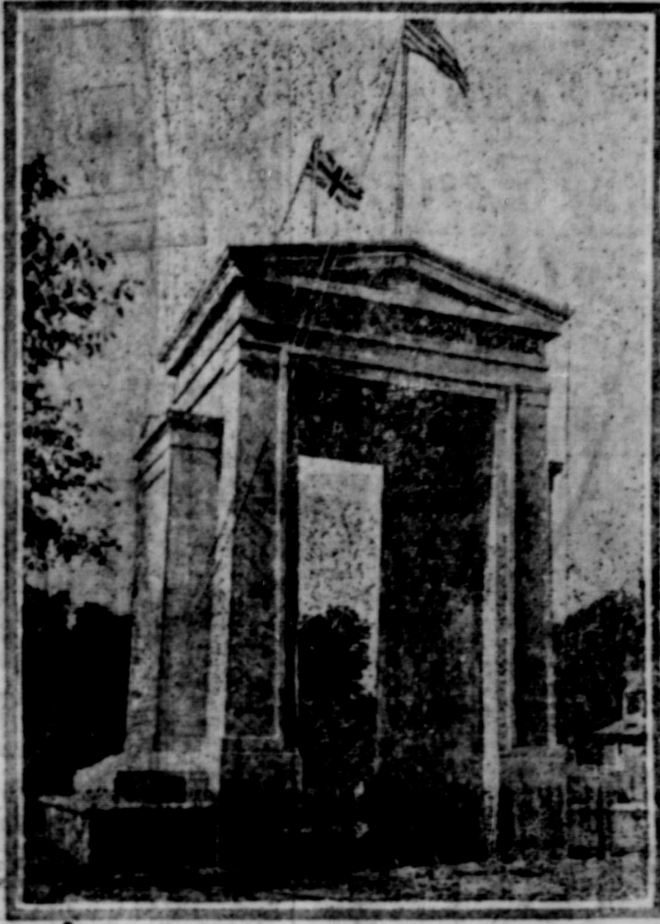
Monument spanning the border at Blaine, Wash., which was dedicated recently. The Stars and Stripes flies from one side, the Canadian Union Jack from the other.