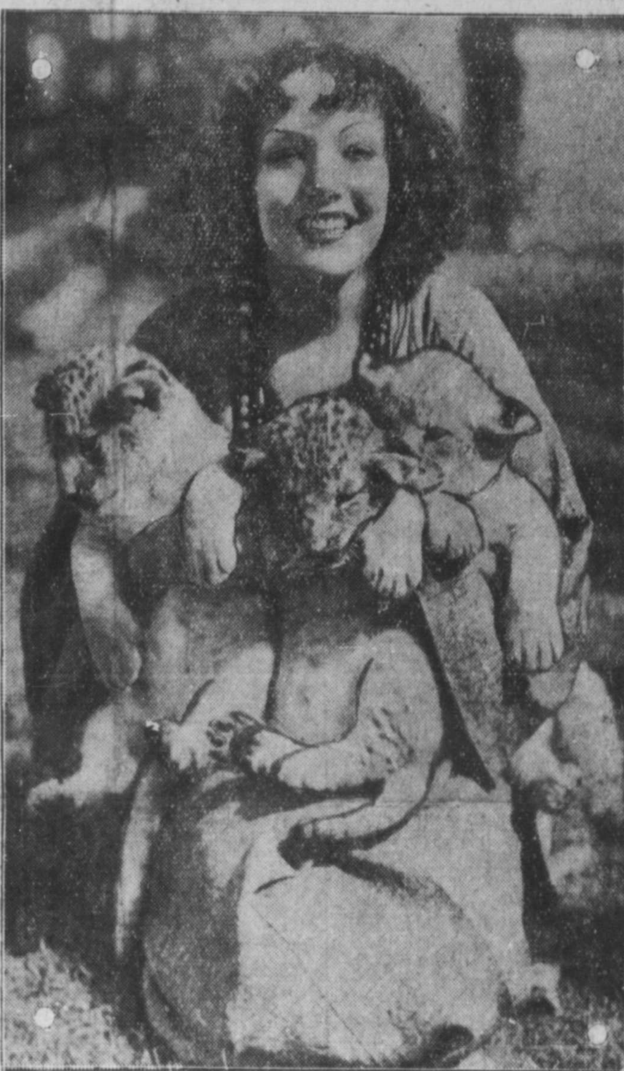
Who wouldn't cuddle cute kittens like these? Trouble is you never can tell when tiger cubs take a fancy to meat. Lupe Velez doesn't seem the least bit afraid, though.