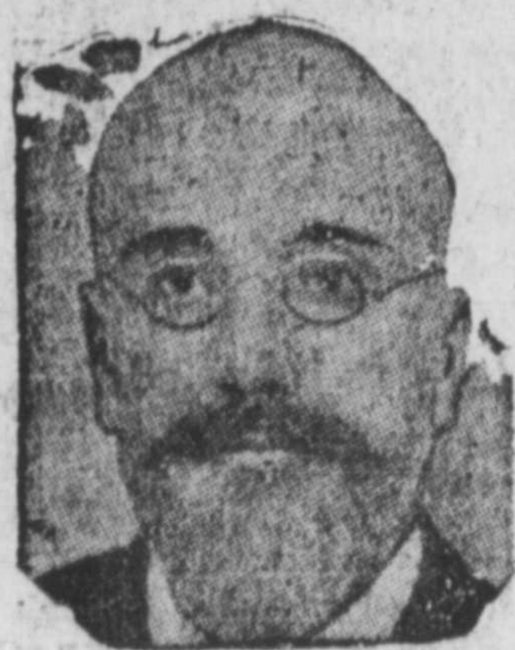
Premier Eliphtheros Venizelos who retains power in Greece as result of poll.