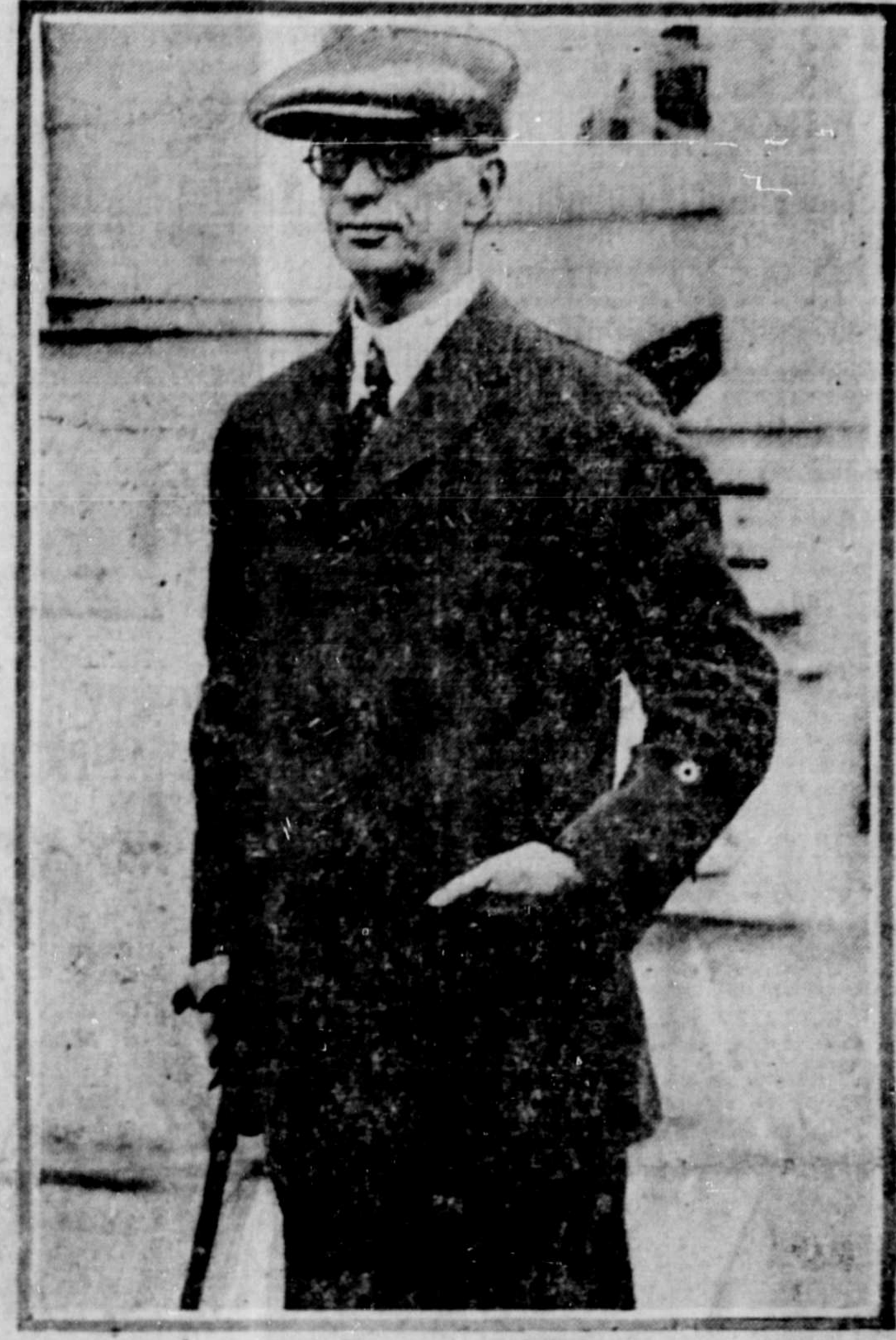
Colonel George Harvey, the new United States Ambassador to the Court of St. James's, photographed on board the Aquitania, when he sailed to take up his new duties.