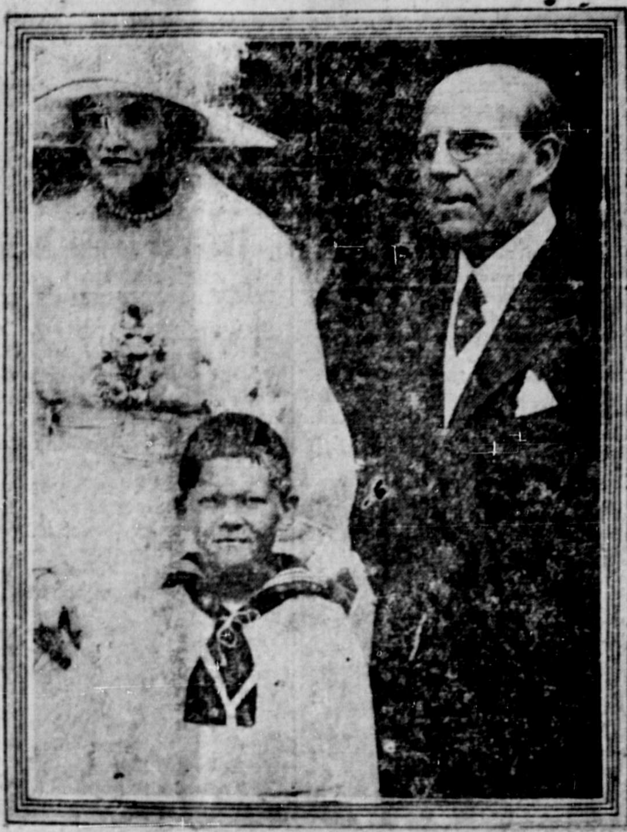
FIGURE IN DIVORCE SUIT.