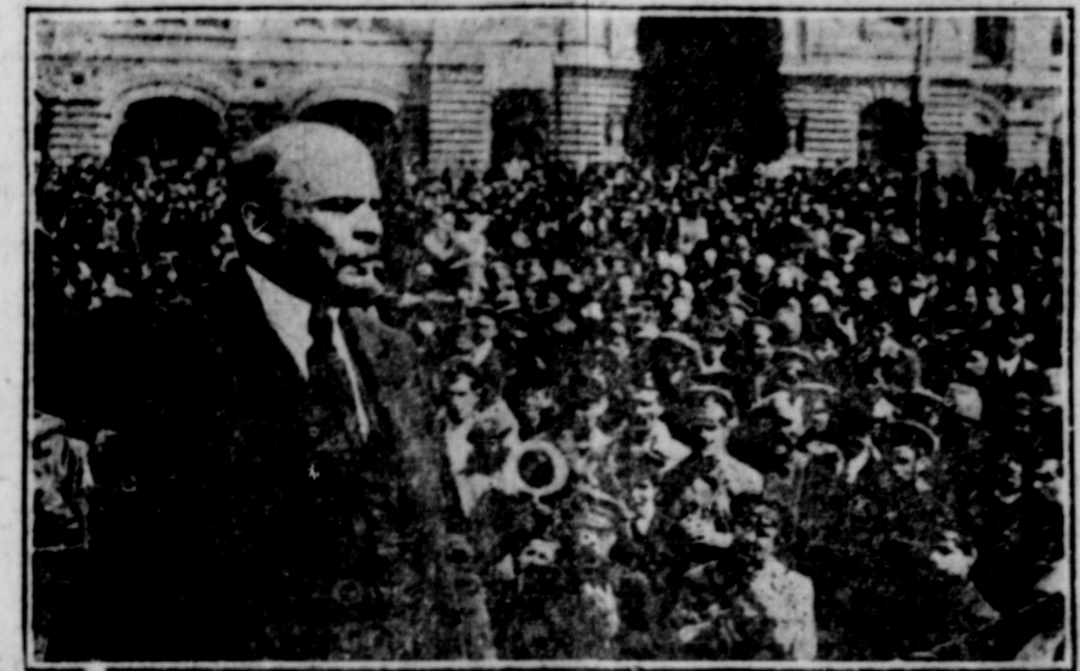
Premier Lenin delivering one of his loyalty speeches to the soldiers that gather in front of the Ministry of War building. This is one of the latest pictures to be received showing the leader of the Russian Soviet Government.