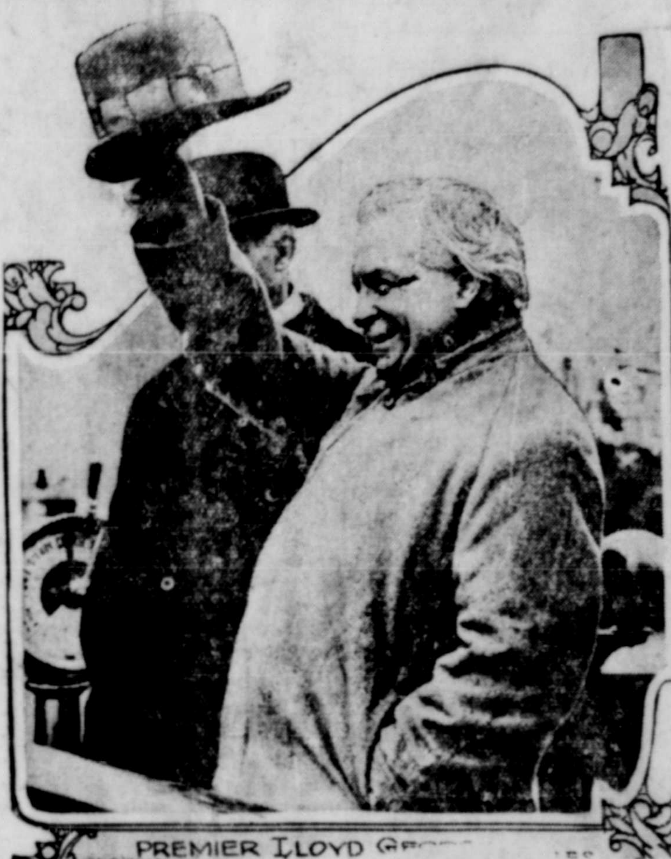
PREMIER LLOYD GEORGE RESIGNED PREMIERSHIP TODAY

BELFAST, Oct. 19.—A bomb thrown into the street exploded injuring four people.