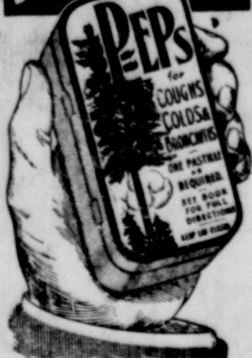
All Dealers 50c. box or from The Peps Co., Toronto.