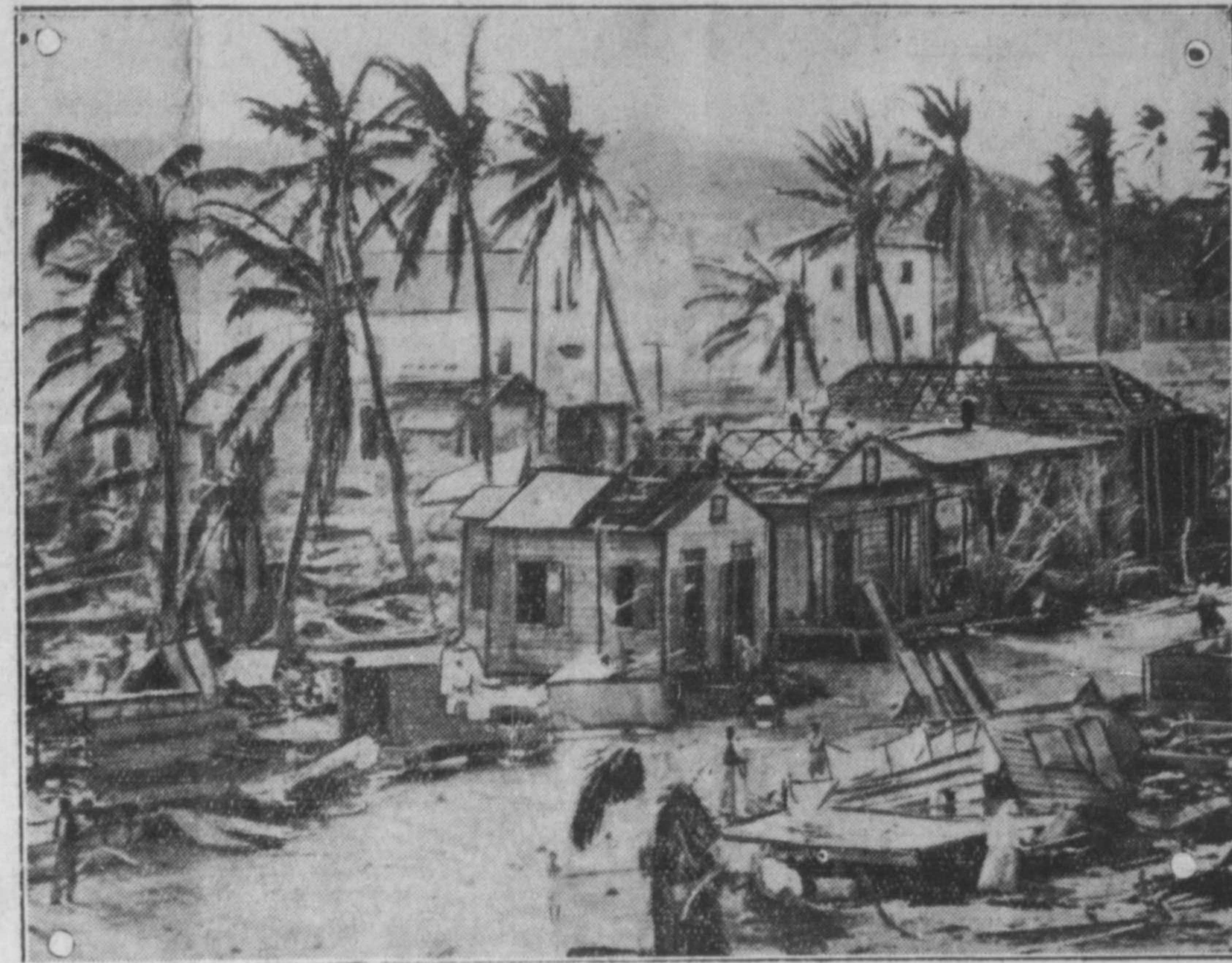
After the big wind! Here is a scene from devastated area near San Juan, Puerto Rico, showing inhabitants beginning to clear away the wreckage. The dead mounted to 200 with thousands injured

It is expected that Johnson will be relieved of his portfolio.