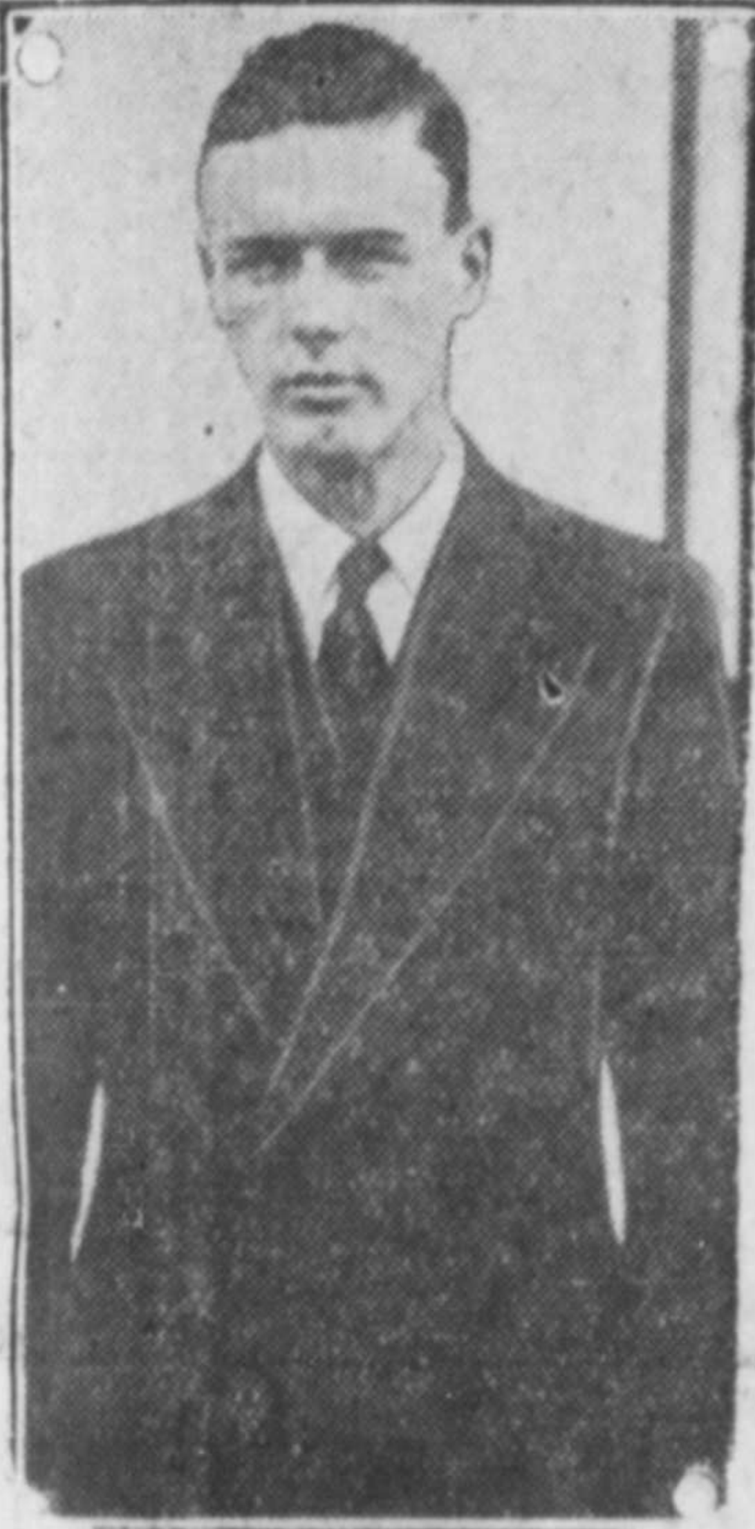
Col. Charles A. Lindbergh who will take delivery of new plane in California.