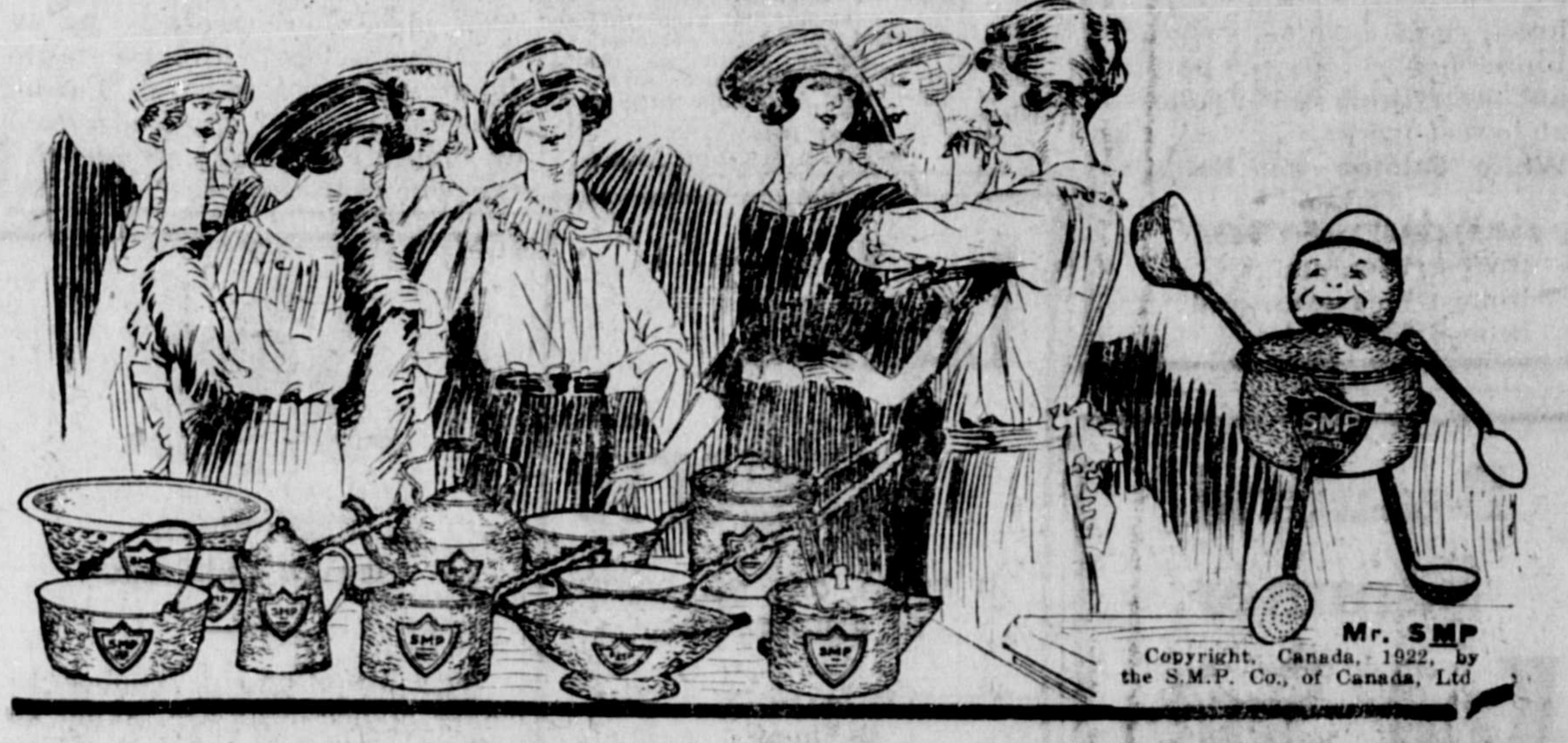
Mr. S.M.P. Copyright, Canada, 1922, by the S.M.P. Co. of Canada, Ltd.

The Sheet Metal Products Co., of Canada Montreal Toronto Winnipeg Edmonton Vancouver Calgary