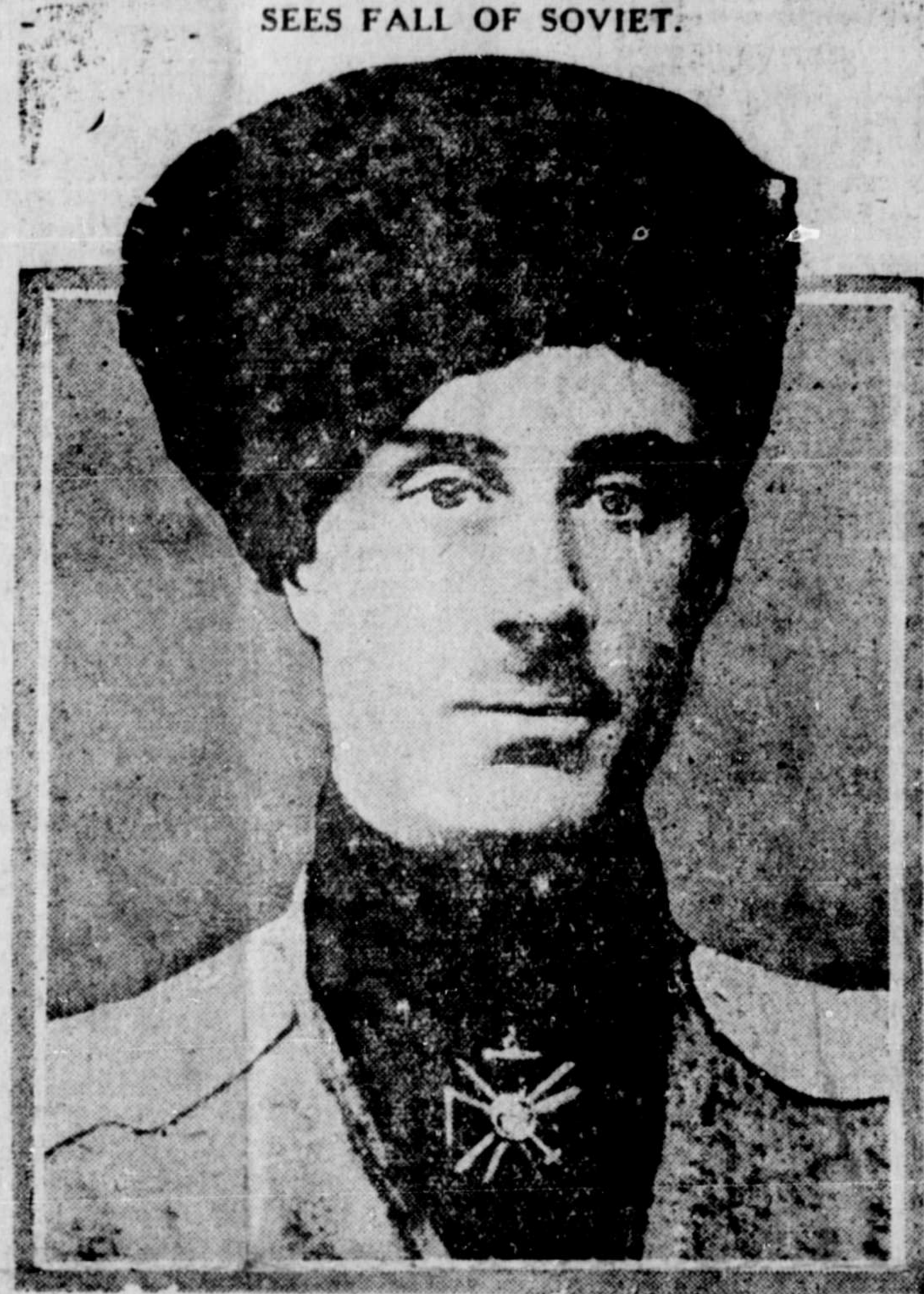
Gen. Wrangle anti-Bolshevik leader, now living in exile, during a recent interview, said that while recognition would prolong the existence of the Soviets in Russia not'ing can prevent their ultimate fall.

NEW ORLEANS, April 10.—Two firemen buried in the ruins of the Elks' Home, which was partially destroyed by fire last night. Seventeen firemen were injured and the financial loss is estimated at a quarter of a million dollars.