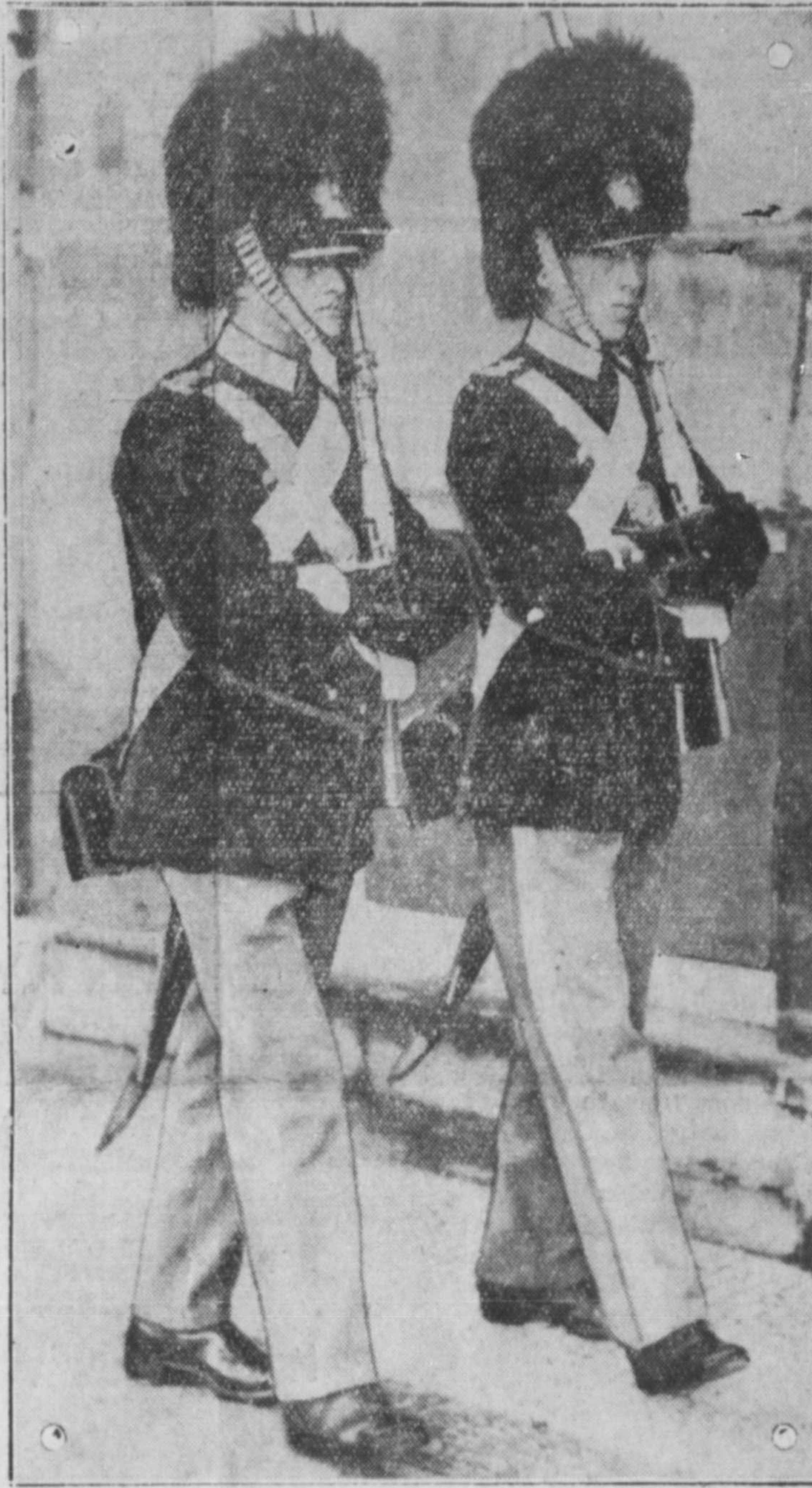
When King Christian of Denmark has a birthday the royal guards put on best bib and tucker and march around the Copenhagen palace. Note peculiar manner of carrying rifles.